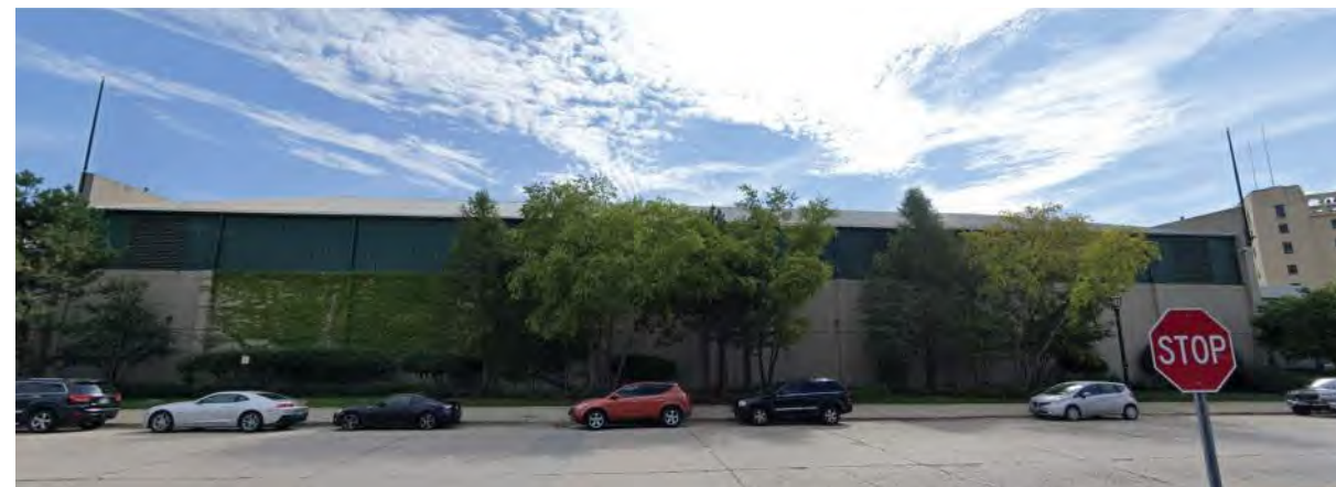
TRIENENS HALL - ASHLAND