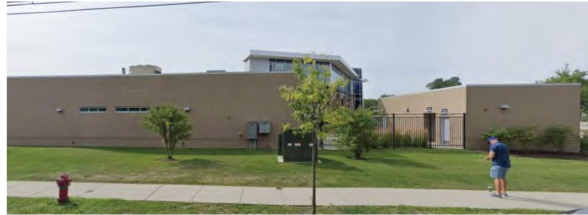
ROCKY MILLER PARK - ISABELLA