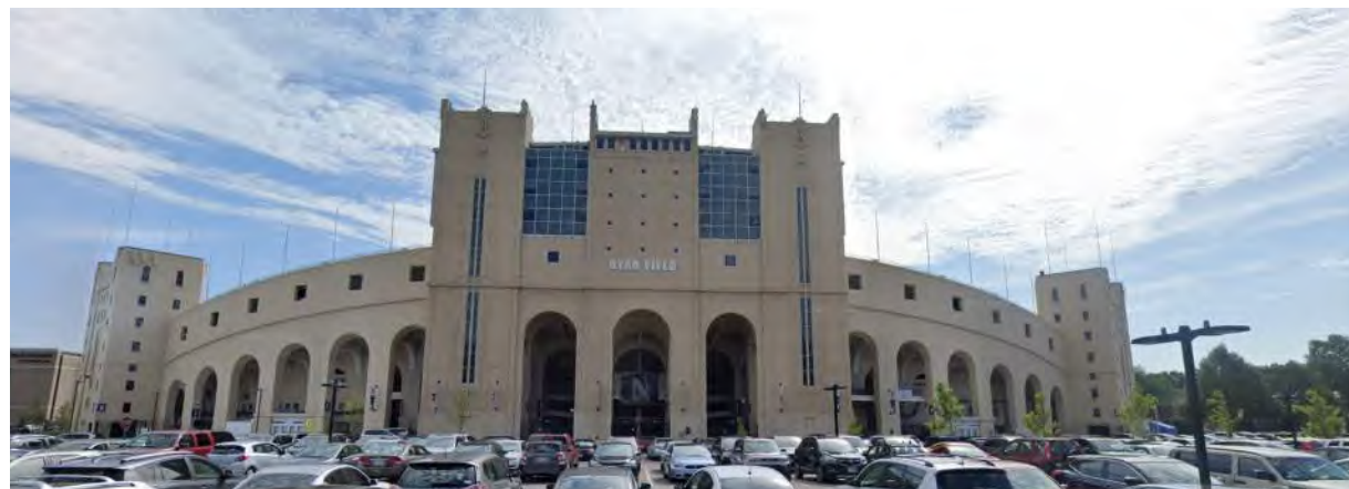
RYAN FIELD - ASHLAND