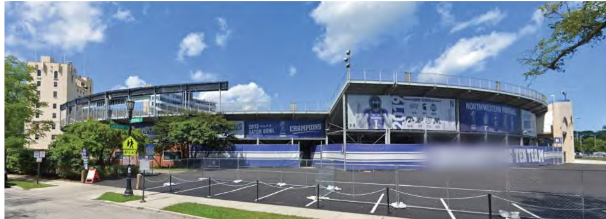
RYAN FIELD - CENTRAL & JACKSON