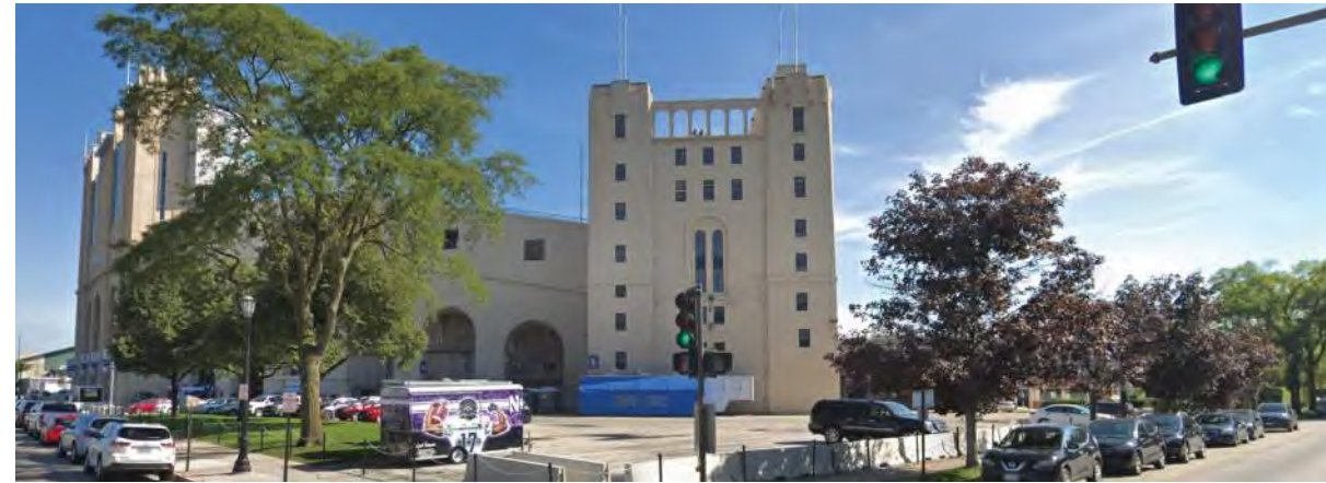
RYAN FIELD - CENTRAL & ASHLAND