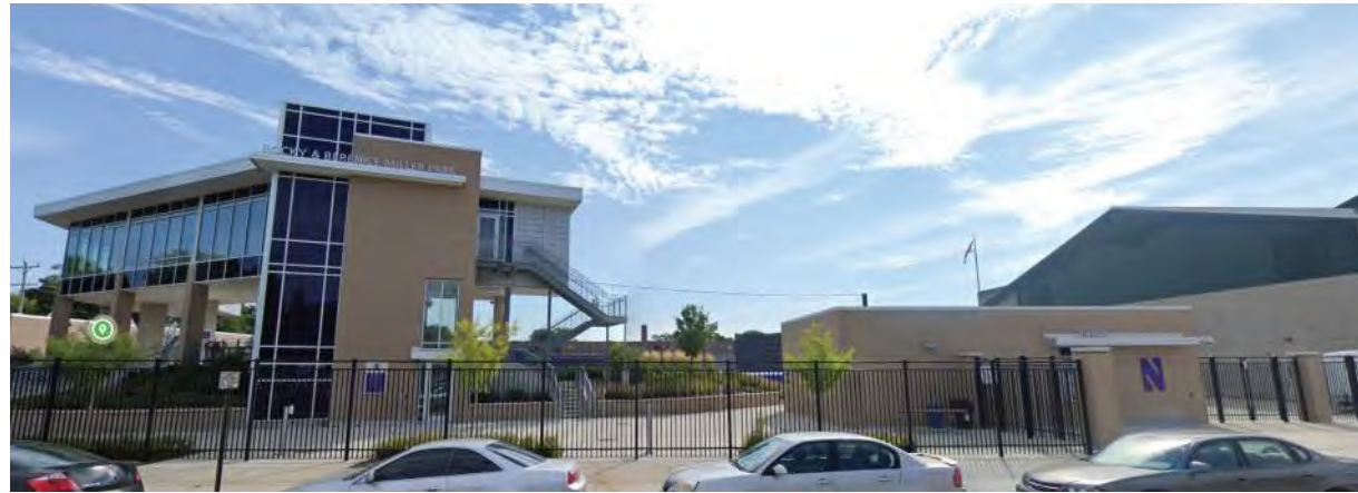
ROCKY MILLER PARK - ASHLAND