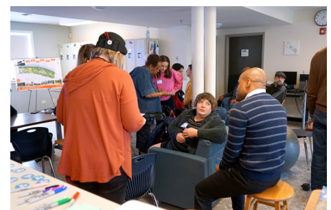
Neighborhood Meeting #2 at the EHS Transition House