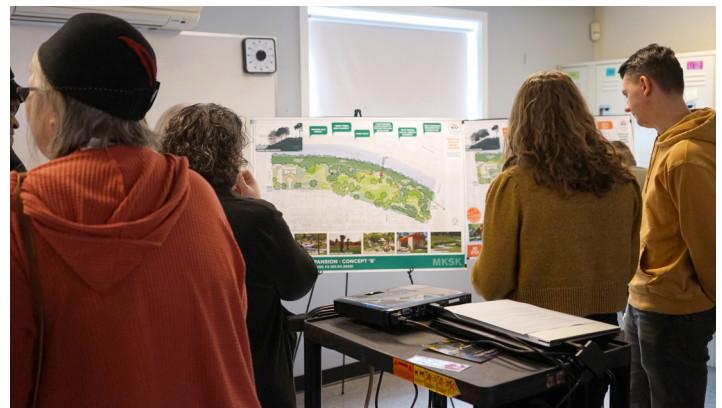
Exercise #1: Design Concepts A, B, and C