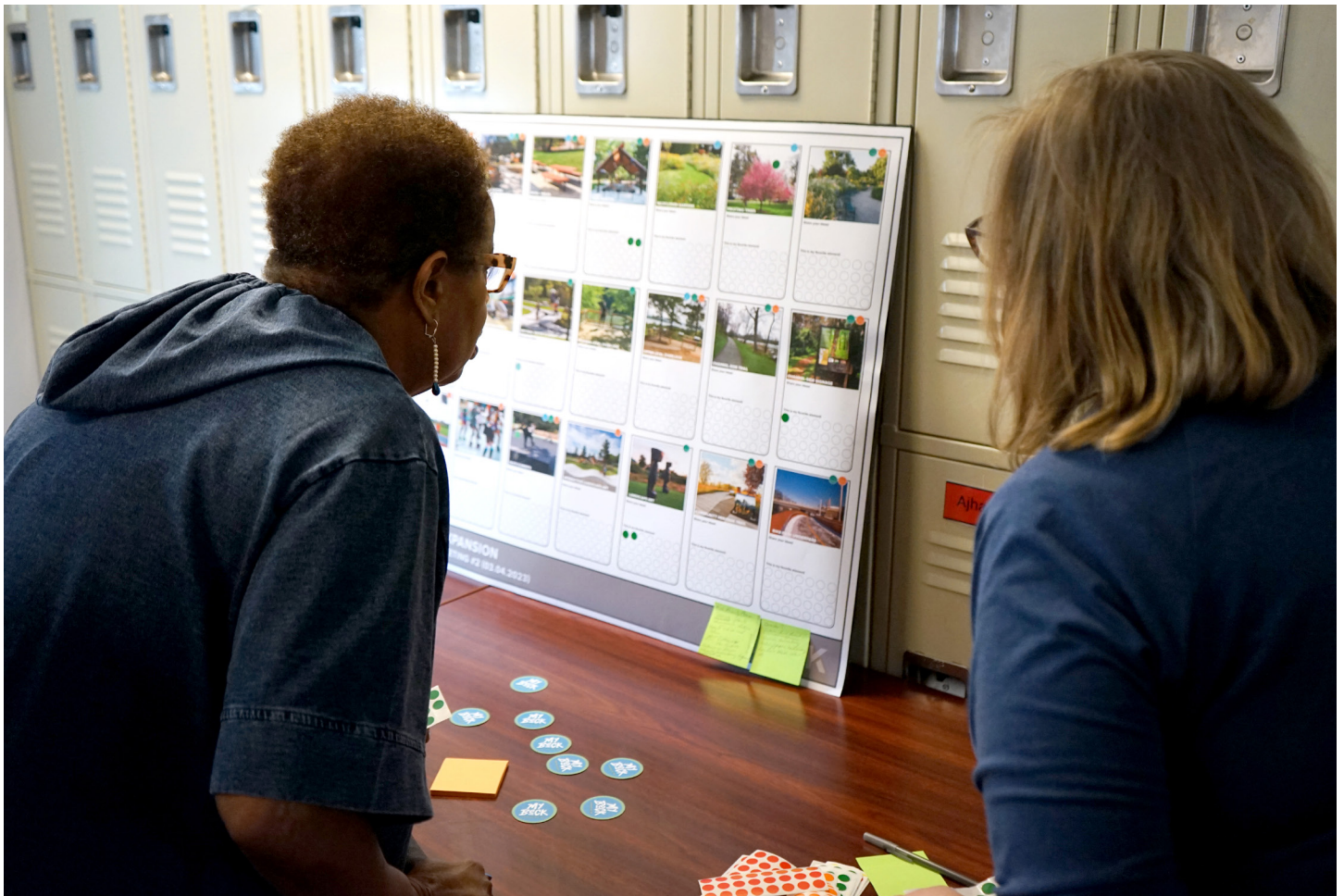
Exercise #2: Programmatic Elements