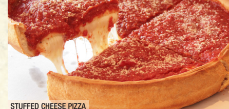
STUFFED CHEESE PIZZA