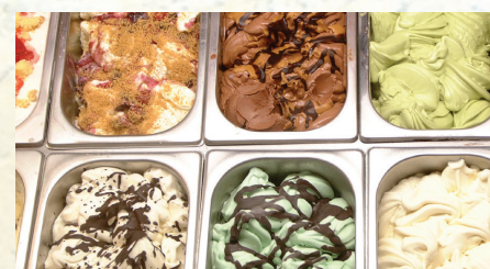
PEPPERONI PAN PIZZA