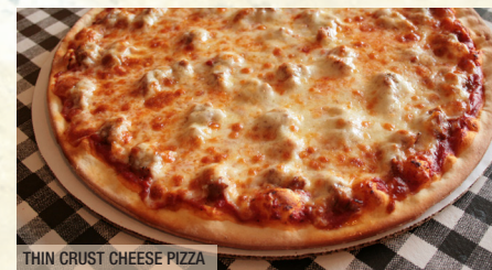
THIN CRUST CHEESE PIZZA