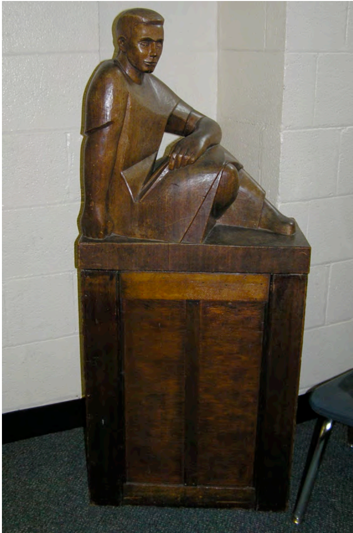
Fig. L. 1 - Wood sculpture of worker (possibly Industrial Trophy by Sidney Loeb), 1930s (WPA).