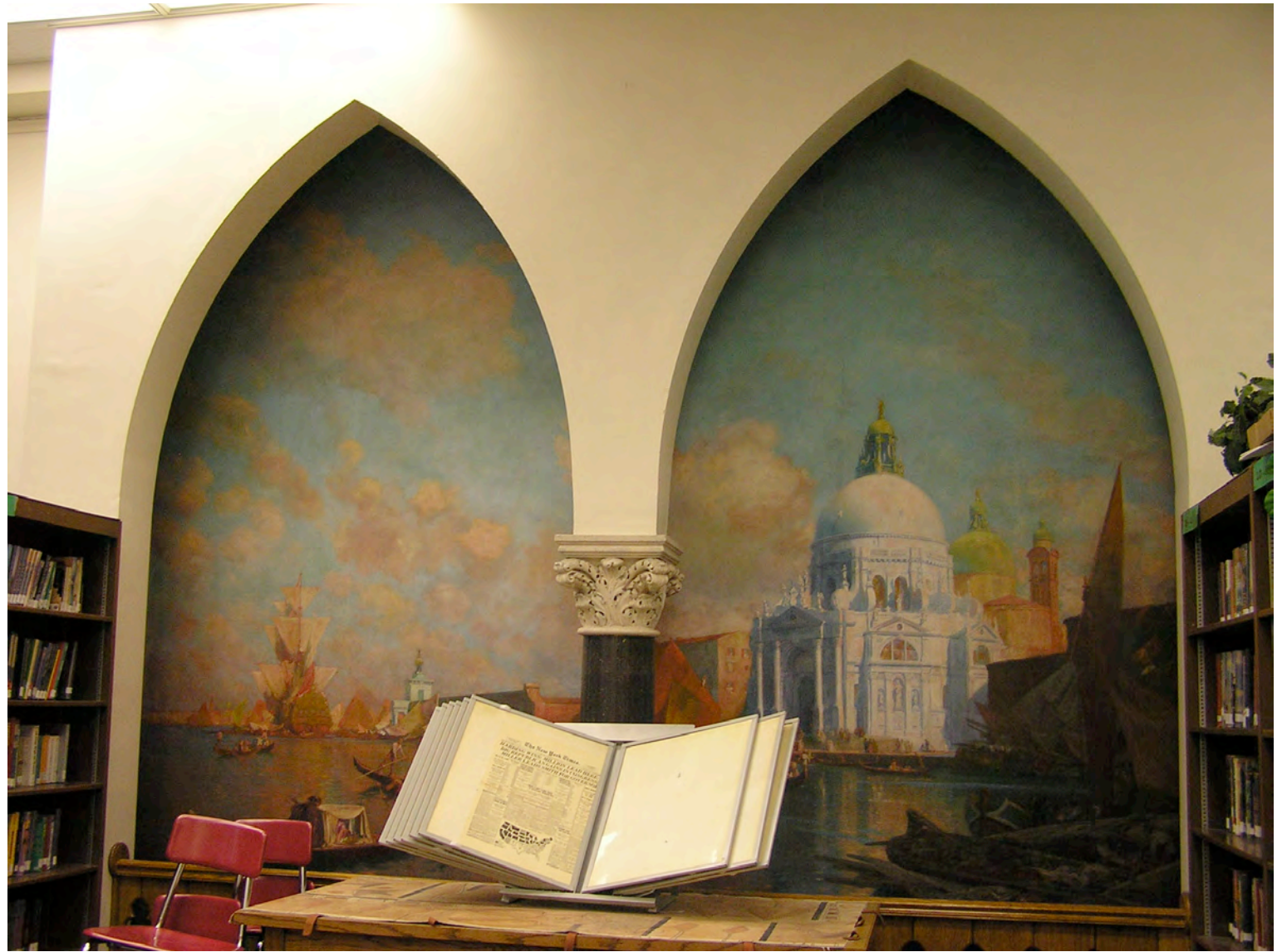
Fig. N. 1 - J. Camoreyt, The Grand Canal with Santa Maria della Salute , 1929, oil on canvas, approx. 12 x 14 ft., Nichols School Library.