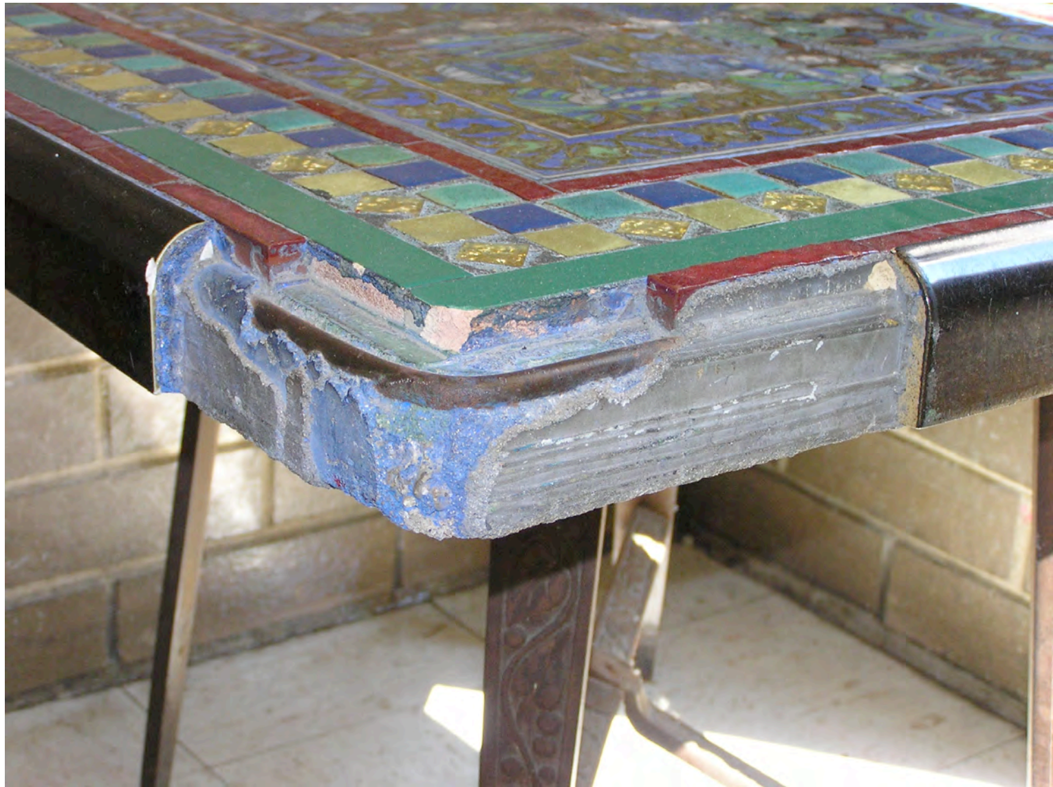
Fig. L. 4 - Damaged corner of table with tabletop installation of Persian tiles.