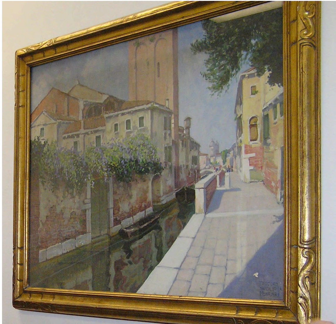
Fig. N. 7 - Teodoro Wolf Ferrari, Canal St. Barnabas in Venice , oil on canvas, approx. 31 x 39 in.