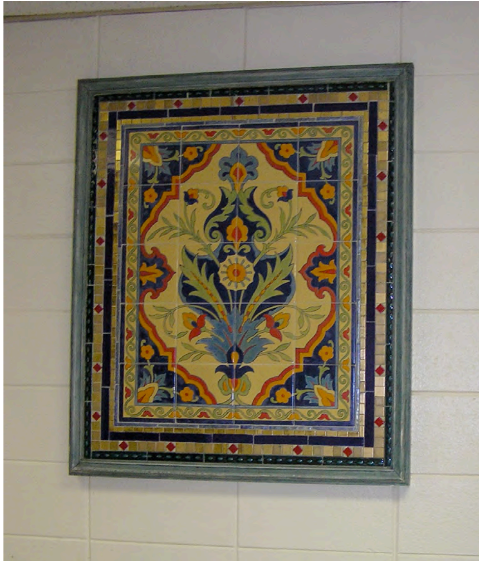
Fig. L. 7 - Wall installation of rare tiles.