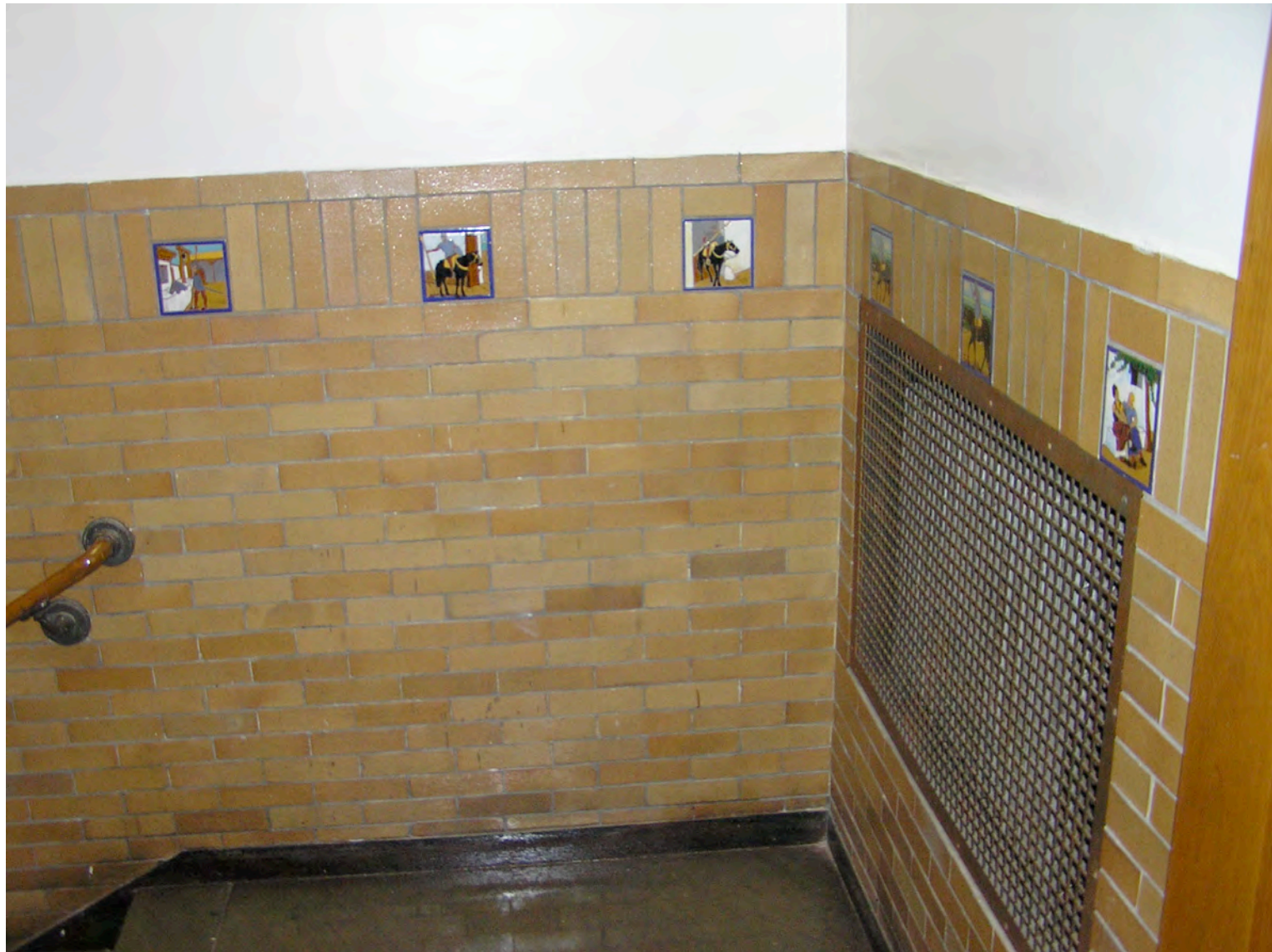
Fig. N. 12 - Some of the 50 tiles illustrating the story of Don Quixote, lining the stairwells of Nichols School.