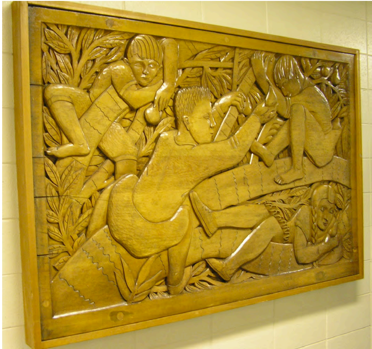
Fig. L. 8 - Andrene Kauffman, Children in Fruit Tree , 1930s (WPA), pine, approx. 4 x 6 ft.