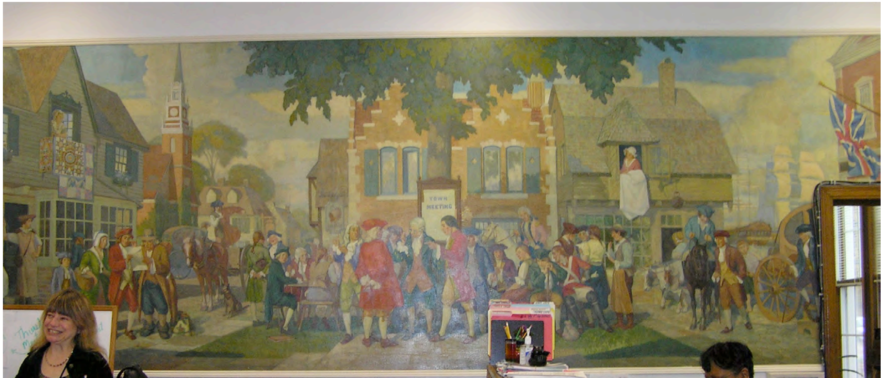
Fig. N. 4 - Town Meeting , probably 1930s, mural on canvas, approx. 7 x 20 ft.