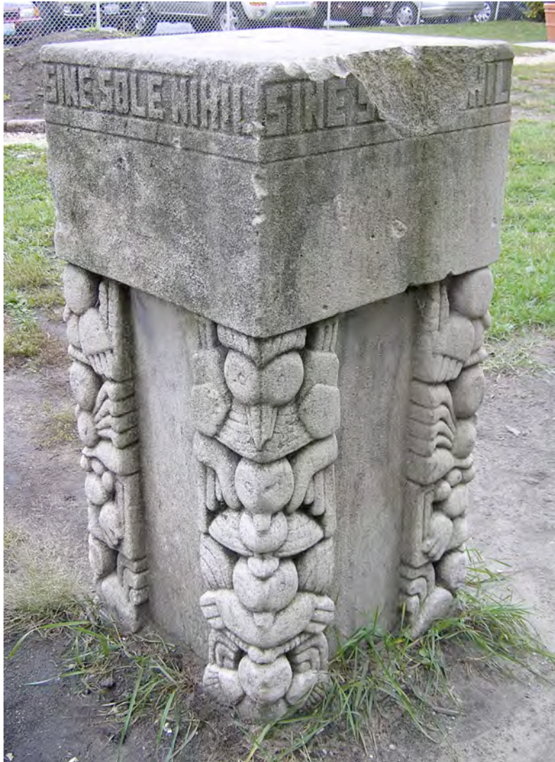
Fig. Oak. 6 - Louise Pain, Sundial , carved stone (damaged), 1936 (WPA), approx. 48 x 18 x 18 in.