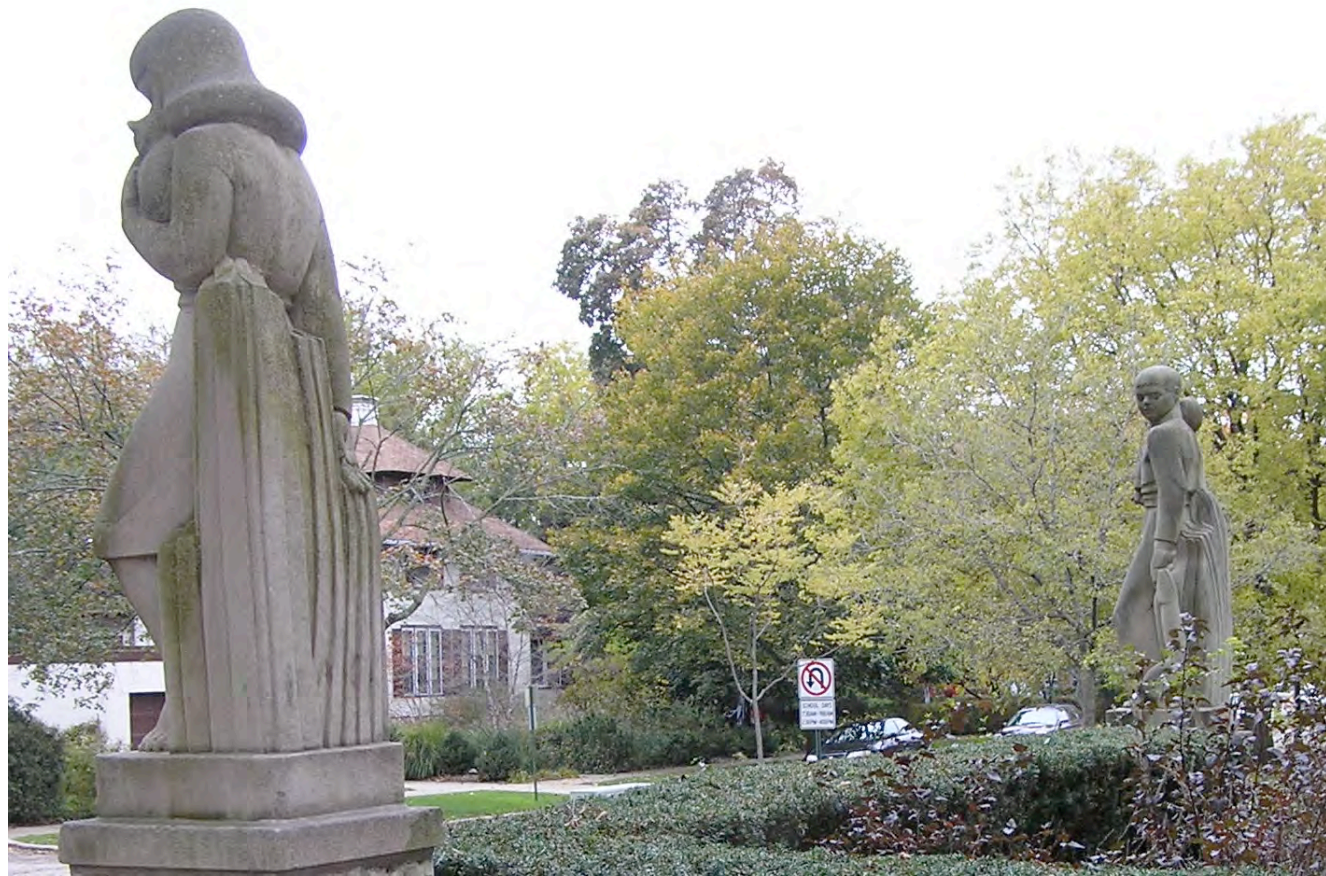
Fig. H. 1 - Mary Andersen Clark, Girl and Boy , 2 of 4 sculptures, 1938 (WPA), Bedford limestone, approx. 6 ft. tall.