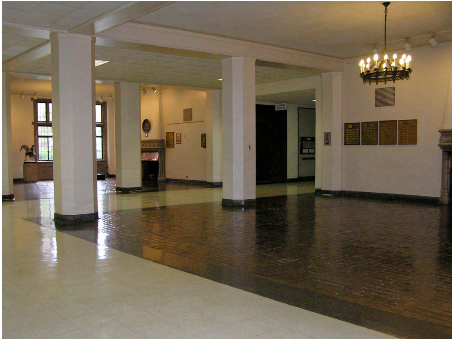
Fig. ETHS 2 - Current view of Welcome Hall in original ETHS building designed by Dwight Perkins, 1924.