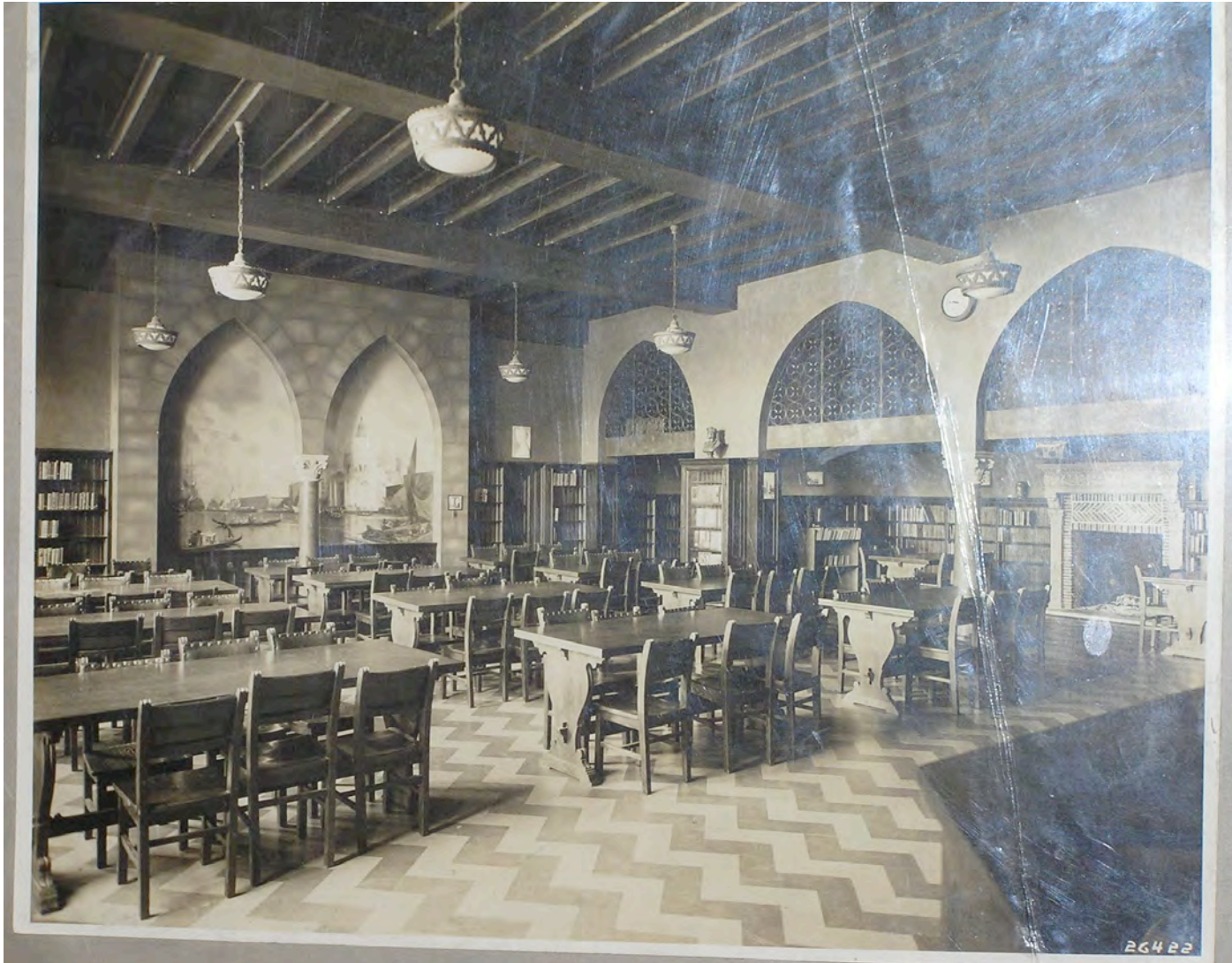
Fig. N. 3 - Vintage Photo of Nichols School Library, c. 1929.