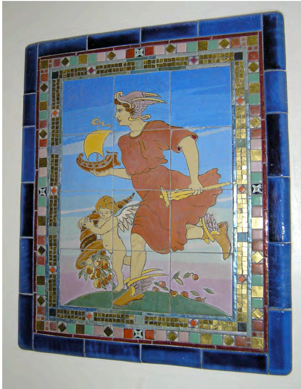
Fig. ETHS 1 - Wall installation of rare tiles depicting the god Mercury (one of two tile panels, the other of the goddess Diana, flanking the Welcome Hall), approx. 4 x 3 ft.