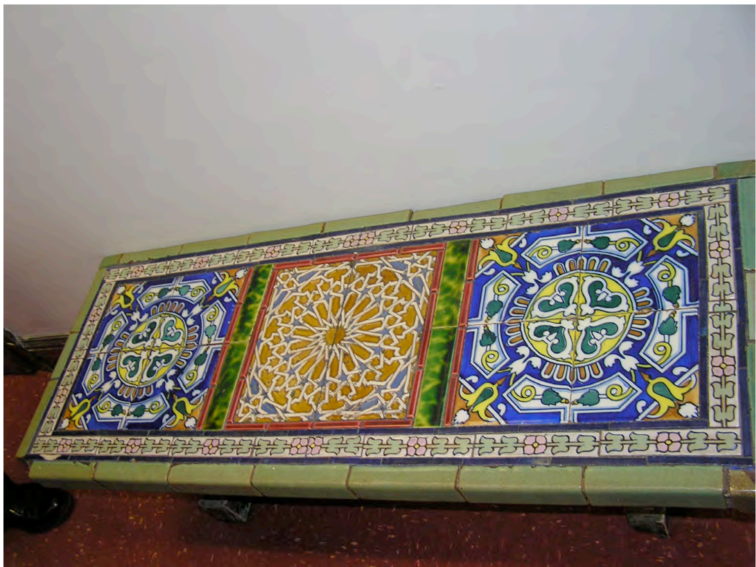
Fig. N. 6 - Top of tile bench shown in previous image.