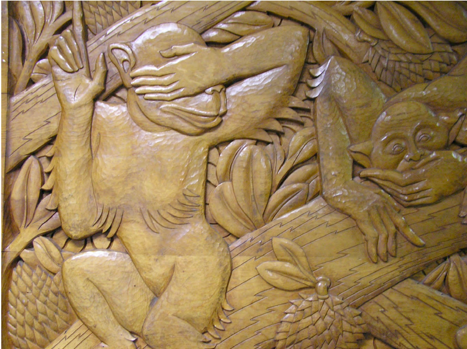
Fig. L. 9 - Andrene Kauffman, See No Evil Speak No Evil Hear No Evil (detail), 1930s (WPA), pine, approx. 4 x 6 ft.