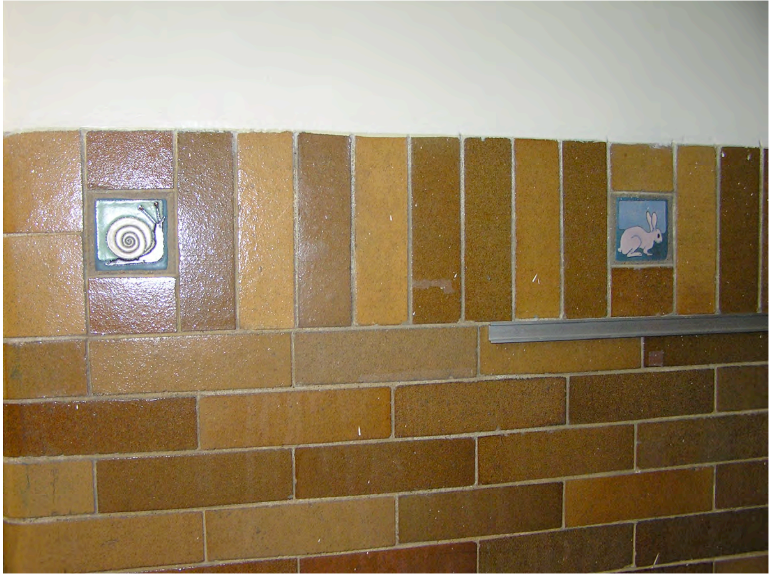
Fig. Oak. 8 - Animal tiles, 2 of dozens of tiles, kindergarten hallway.