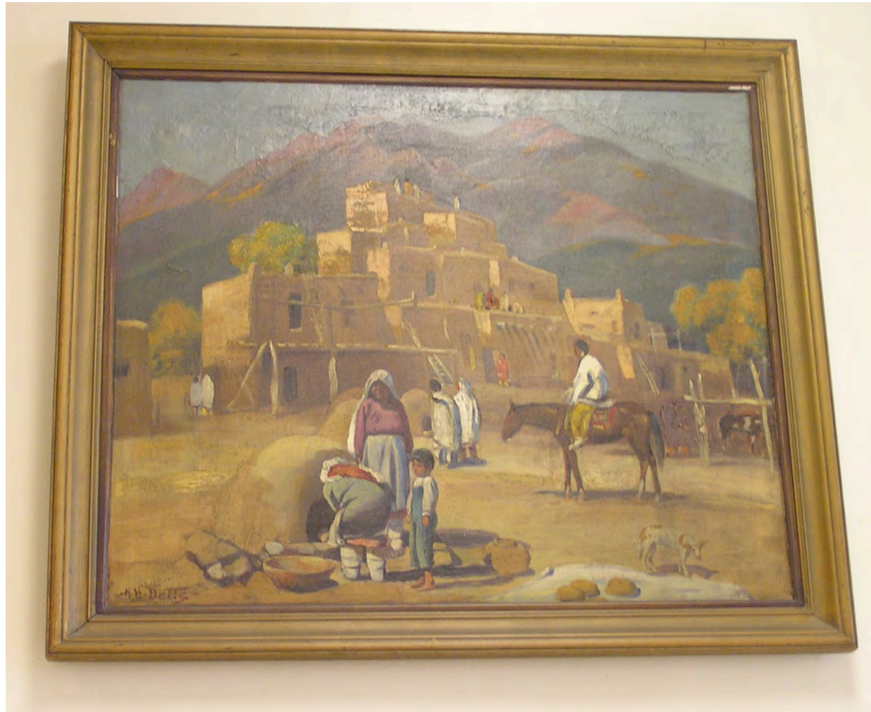
Fig. Oak. 7 - H. H. Betts, Pueblo de Taos , oil on canvas, approx. 32 x 38 in.