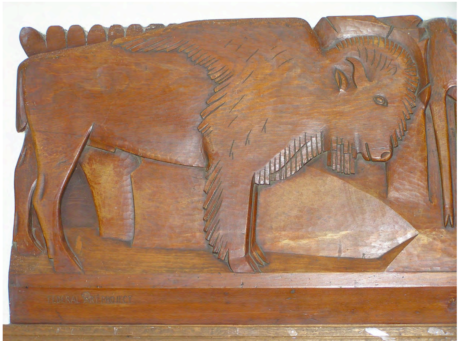
Fig. Oak. 4 - Alfred Lenzi, Wild Animals of America (detail), 1937/39 (WPA), pine.