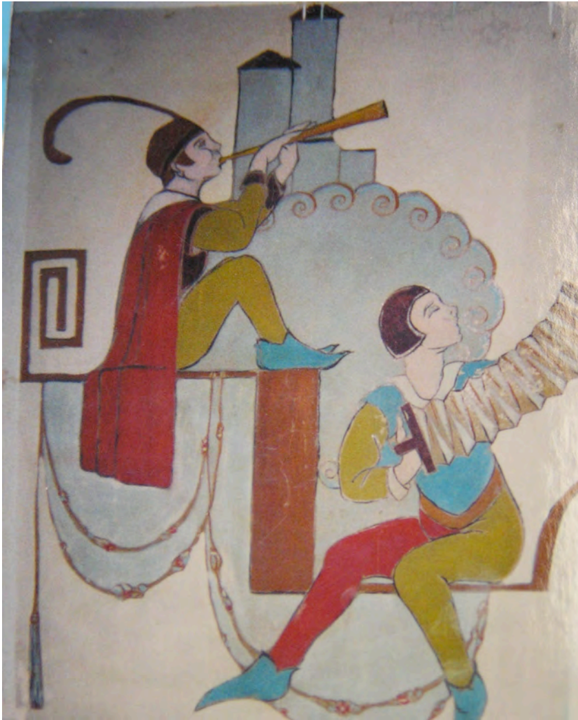
Fig. Oak. 5 - Mural (left half), 1930s? Currently covered by temporary wall in kindergarten classroom.