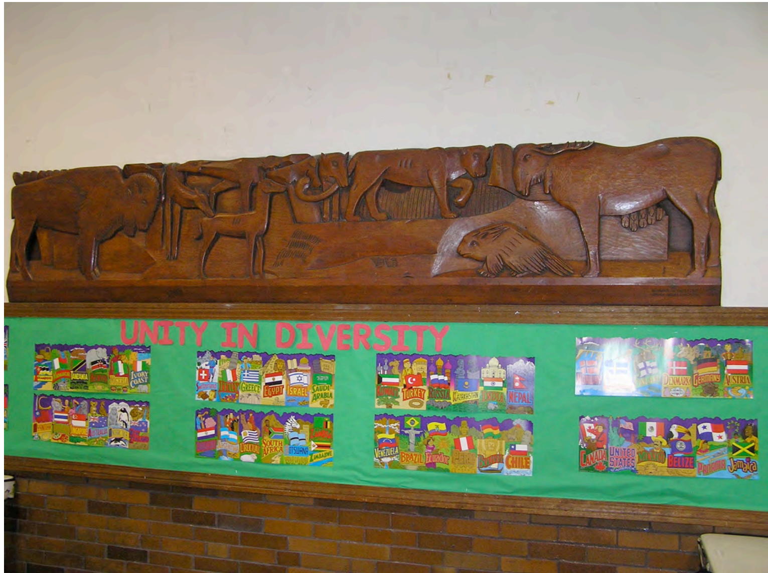
Fig. Oak. 3 - Alfred Lenzi, Wild Animals of America , 1937/39 (WPA), pine, approx. 2 x 10 ft.