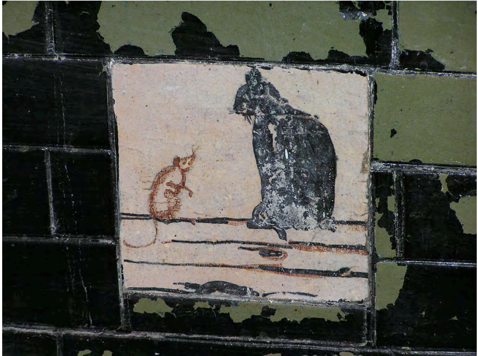
Fig. Oak. 10 - Cat and Mouse , damaged tile, kindergarten classroom.