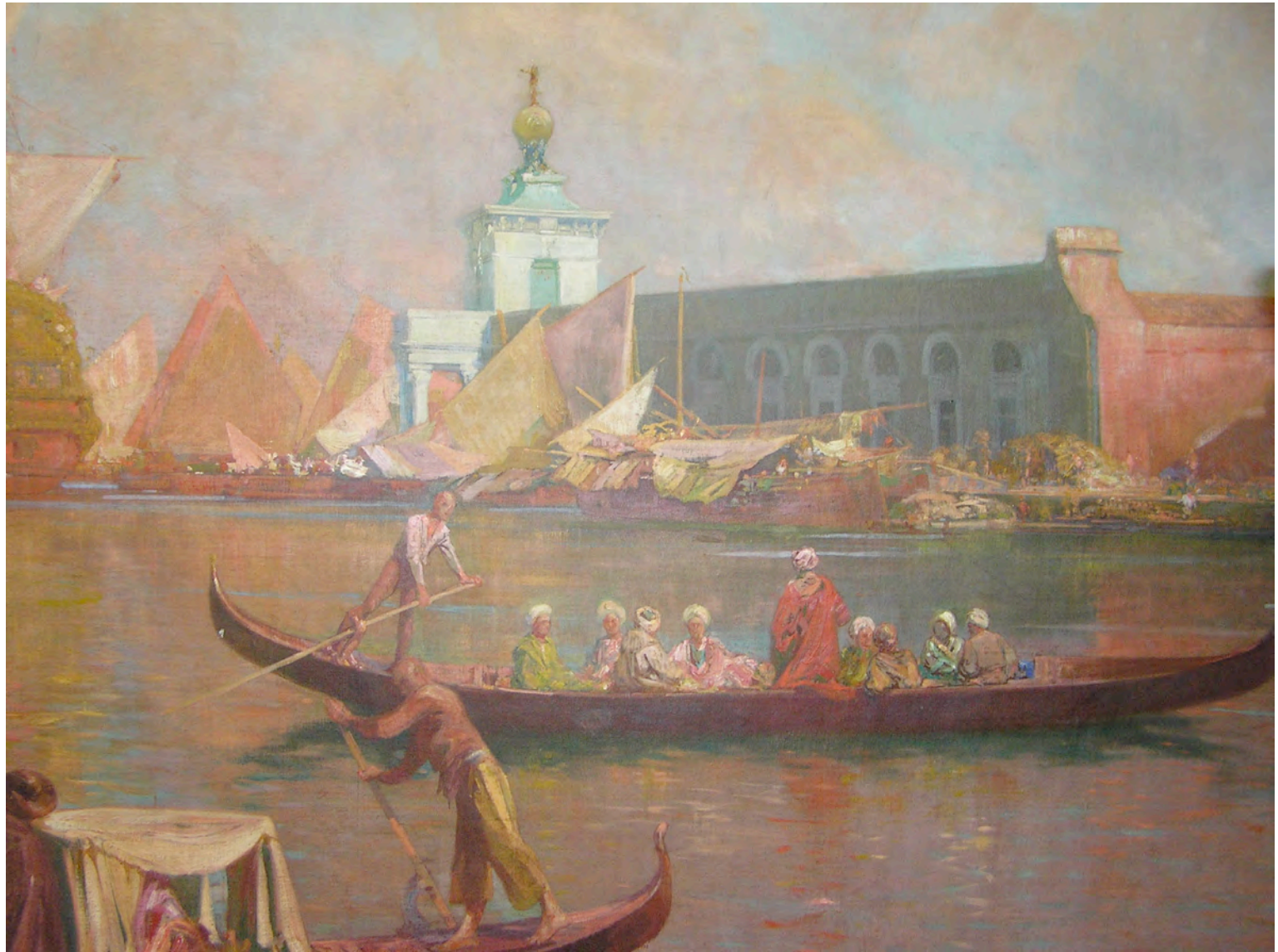
Fig. N. 2 - J. Camoreyt, The Grand Canal with Santa Maria della Salute (detail), 1929.