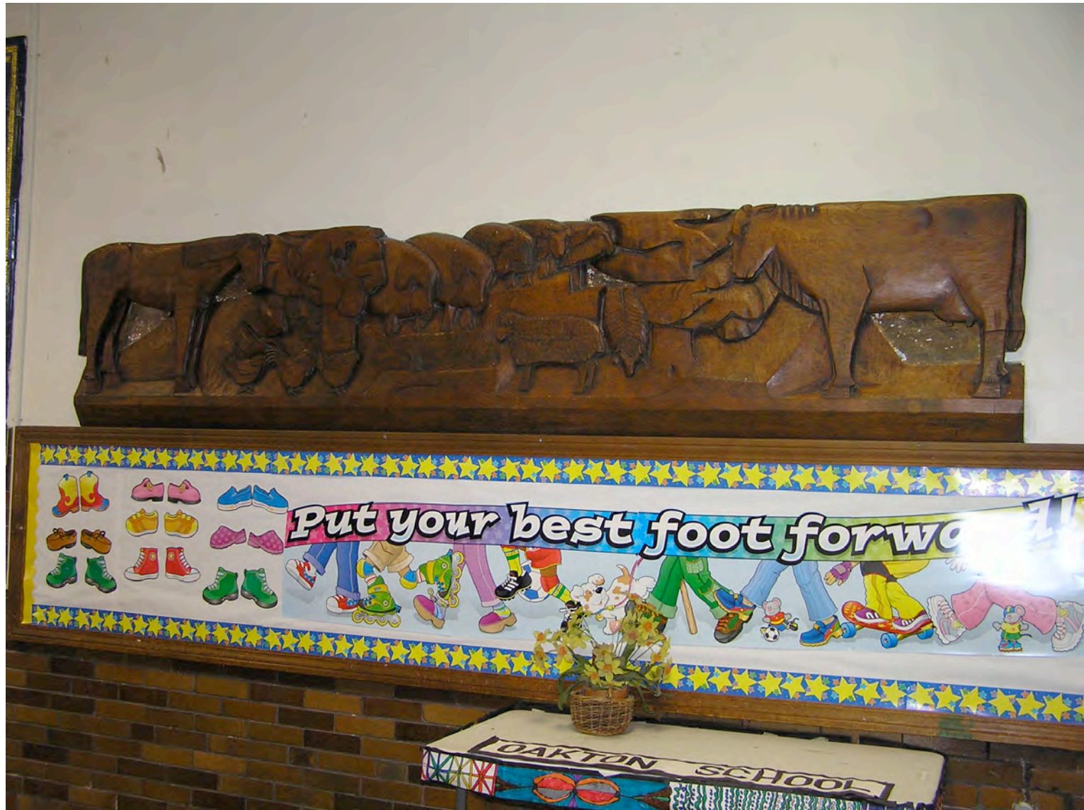
Fig. Oak. 2 - Alfred Lenzi, Domestic Animals of America , 1937/39 (WPA), pine, approx. 2.5 x 12 ft..