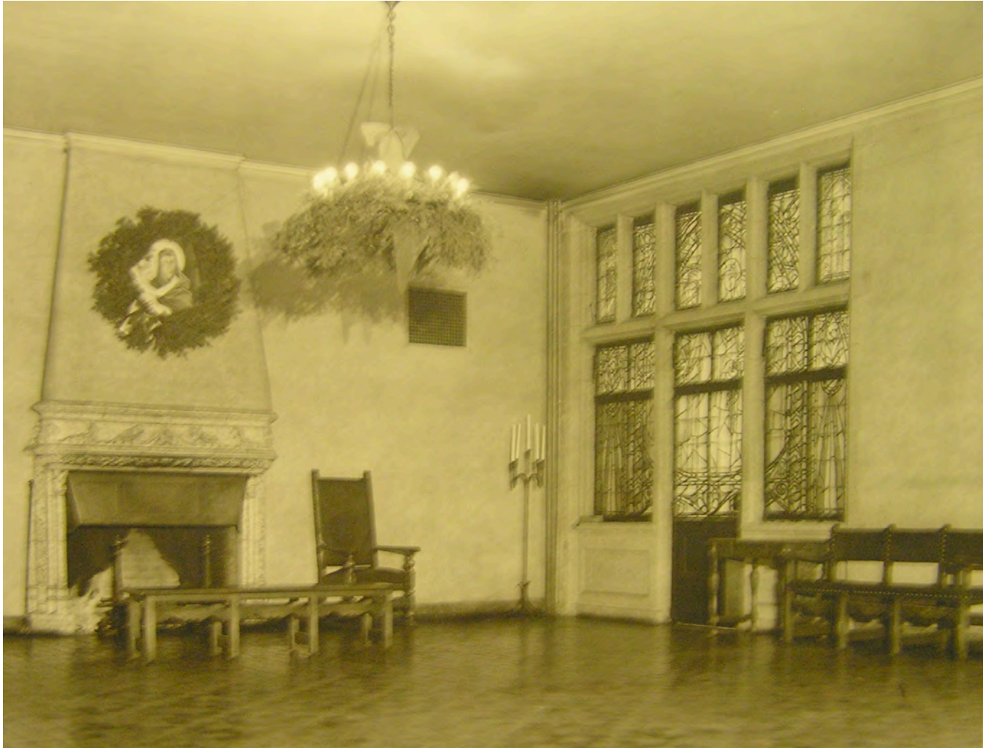
Fig. ETHS 3 - Vintage photo of north side of Welcome Hall, as it looked originally.