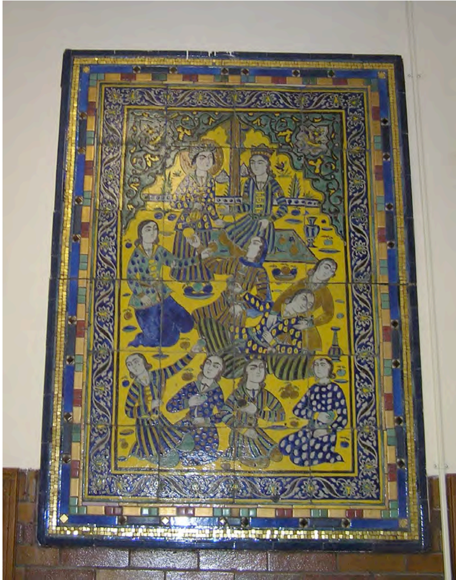
Fig. Oak.1 - Wall installation of 16th C. Persian tiles, approx. 10 x 6 ft.