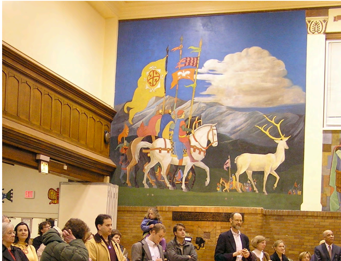
Fig. Oak. 11 - Song of Roland , restored mural.