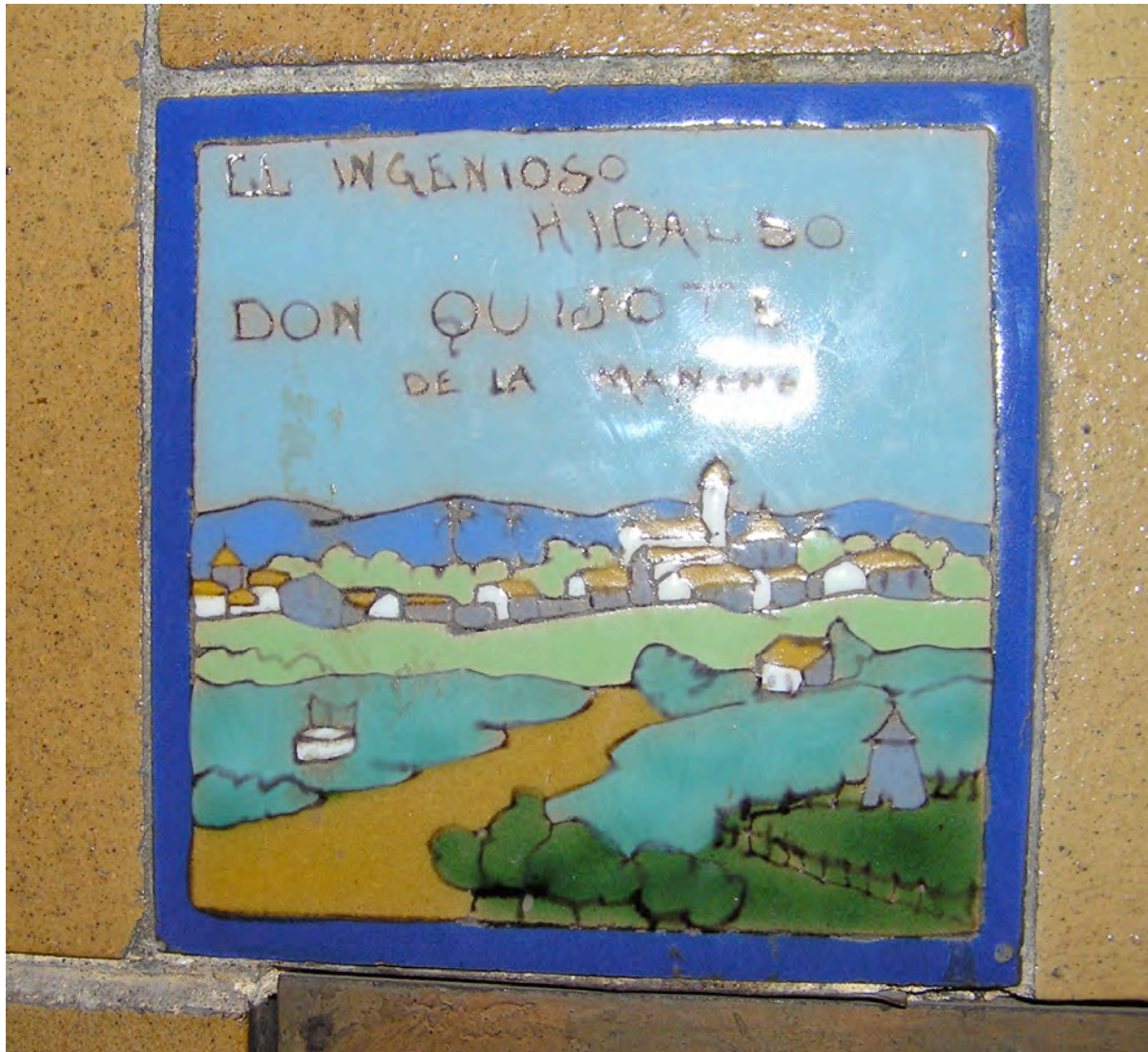
Fig. N. 11 - First tile in a series of about 50 tiles illustrating the story of Don Quixote, lining the stairwells of Nichols School.