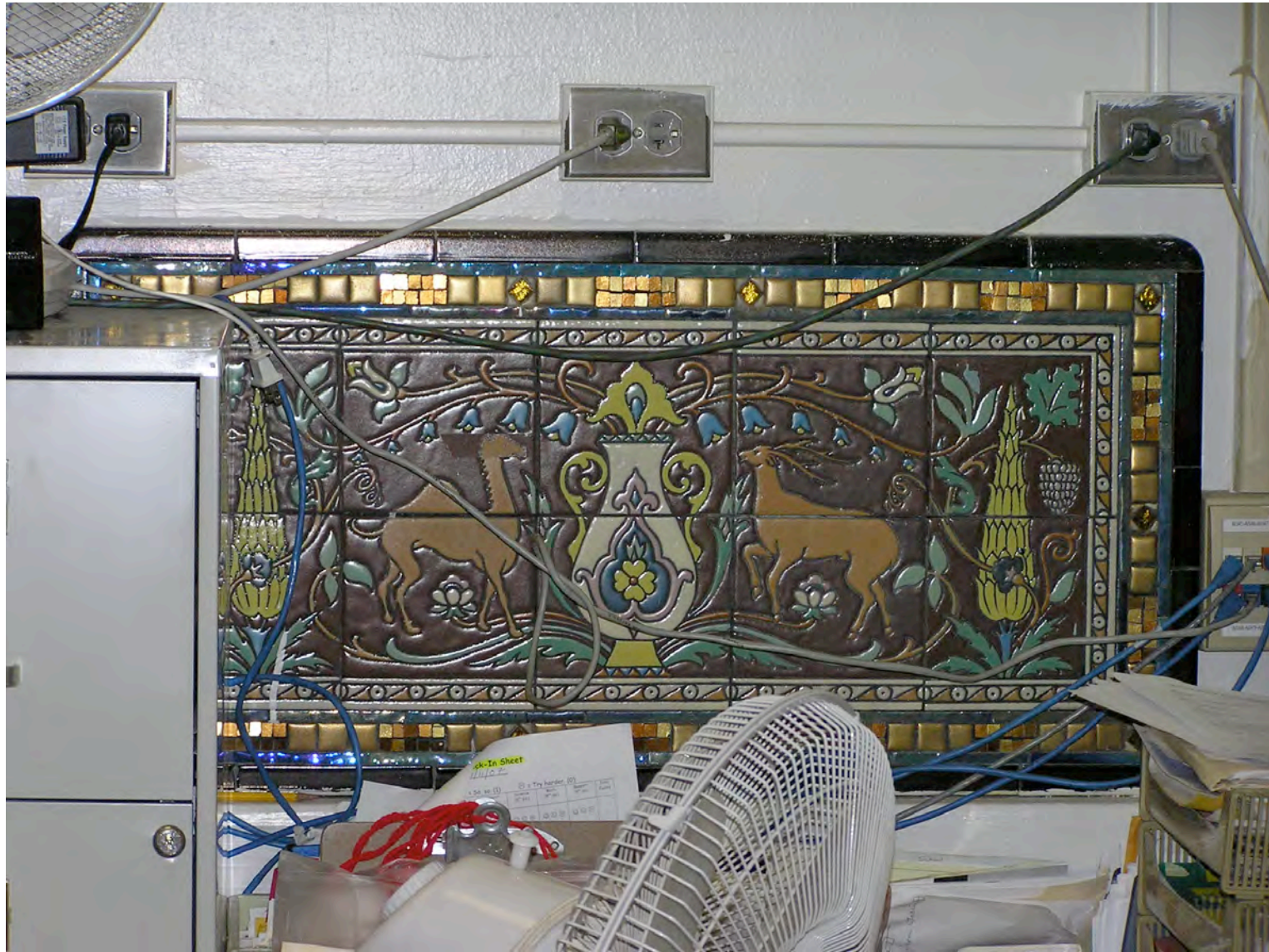
Fig. N. 13 - Wall installation of rare tiles.