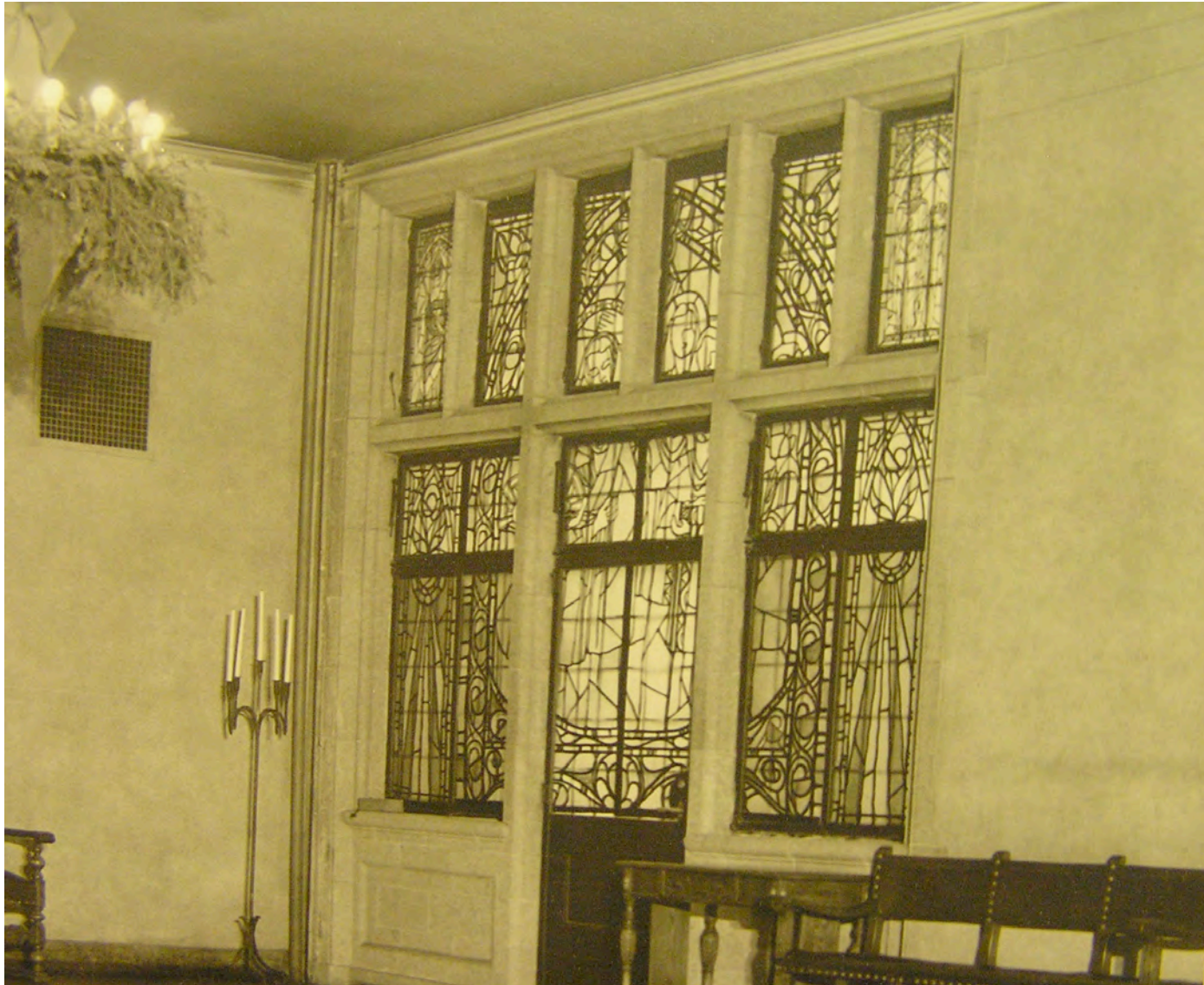
Fig. ETHS 4 - Vintage photo of north wall of Welcome Hall, showing elaborate window design, now lost.