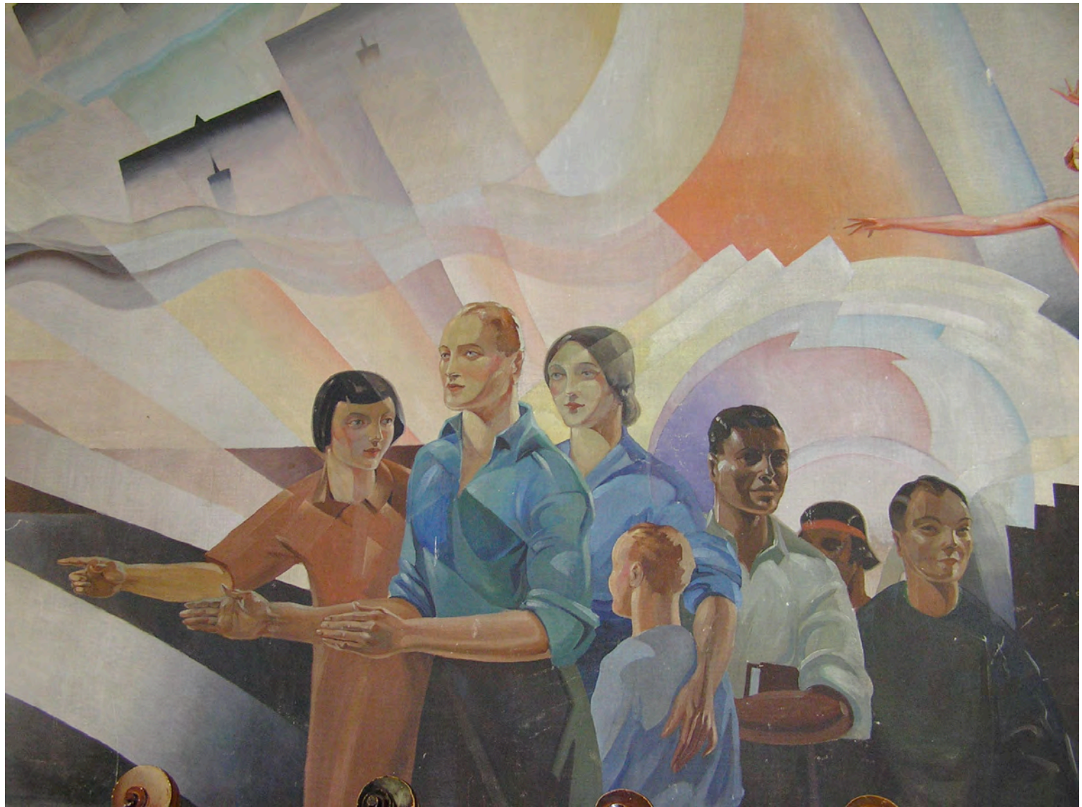
Fig. H. 5 - Carl Scheffler, Mural in Music Room (detail of citizen group), 1936.