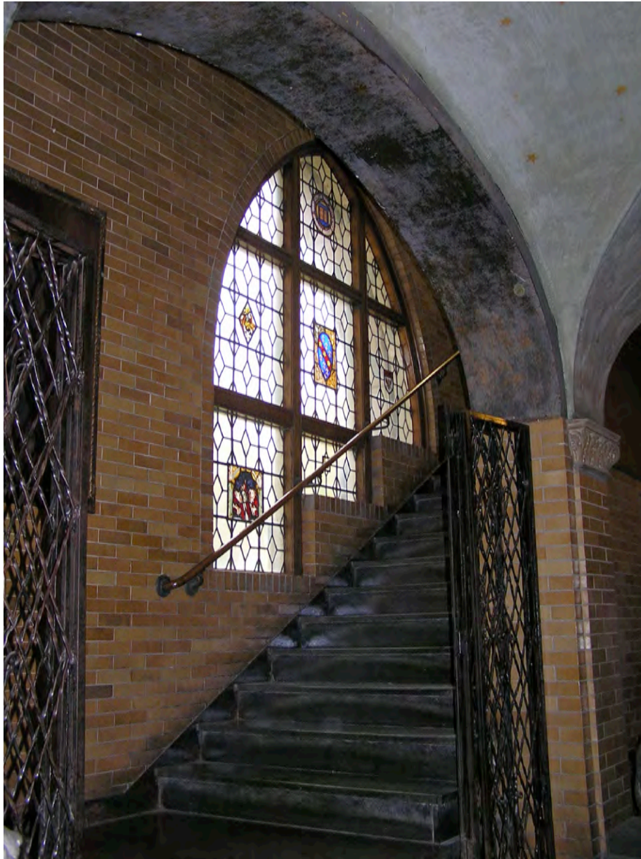
Fig. N. 8 - Stairwell in Nichols School, showing window with stained glass.