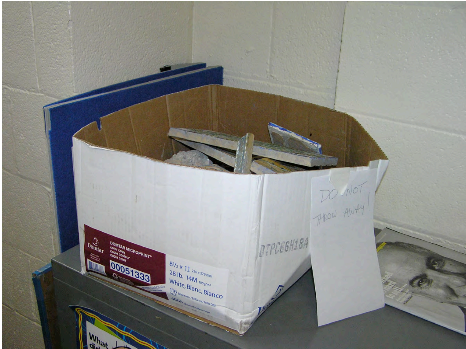
Fig. L. 3 - Box containing the pieces of a bench created by Frederick Nichols from rare tiles.