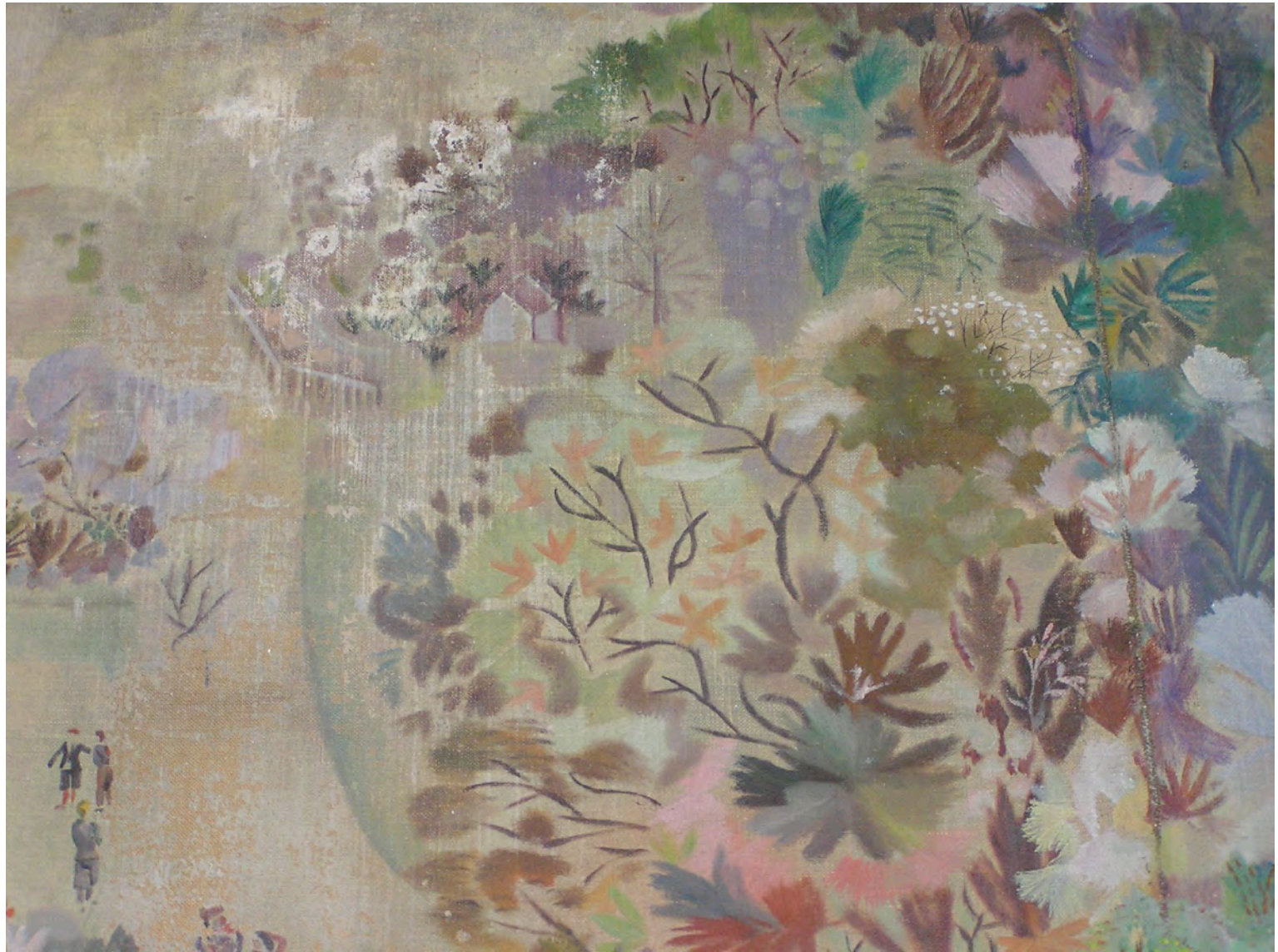
Fig. H. 7 - Rainey Bennett , Mural in Drama Room (detail of landscape, showing damage), 1930s.