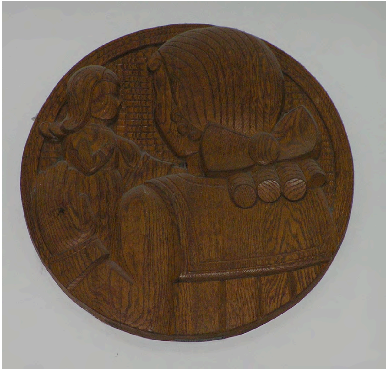
Fig. H. 2 - Louise Pain, Girl with Doll , 1 of 9 reliefs, 1930s (WPA), oak, approx. 20 in. diameter.