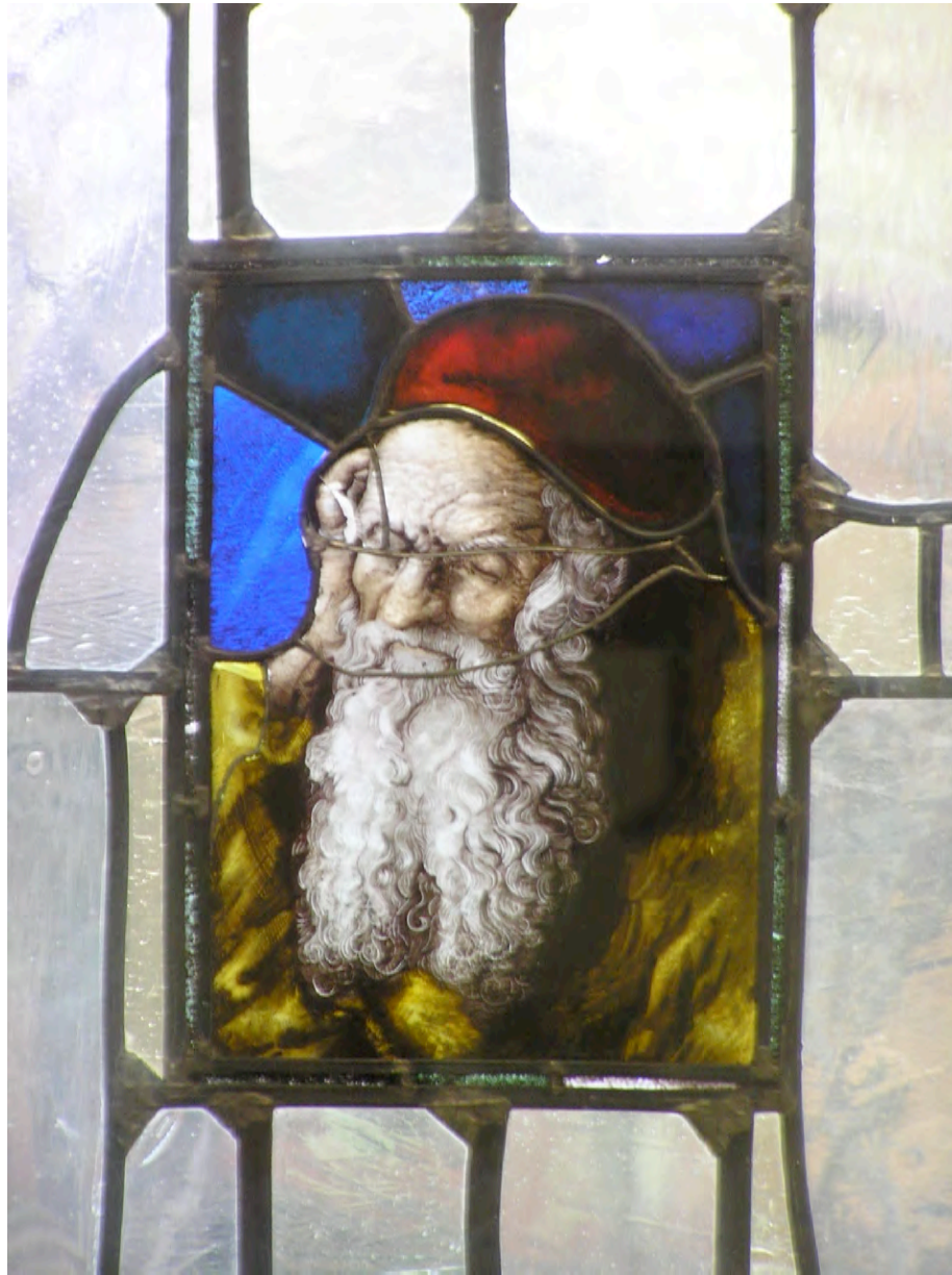
Fig. N. 9 - Detail of stained-glass window.