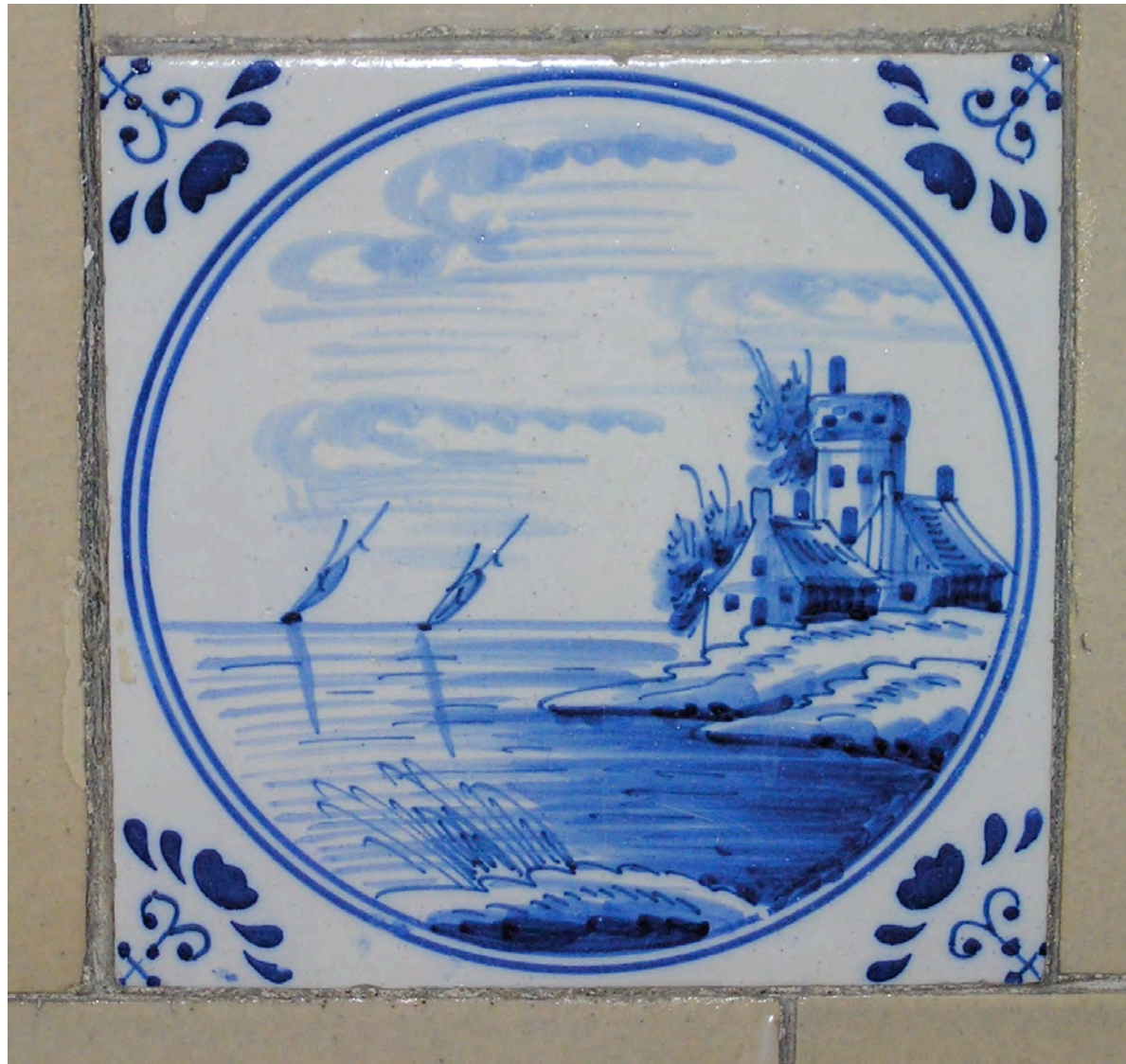
Fig. N. 10 - Delft tile (one of dozens lining the walls of the lunch room of Nichols School)