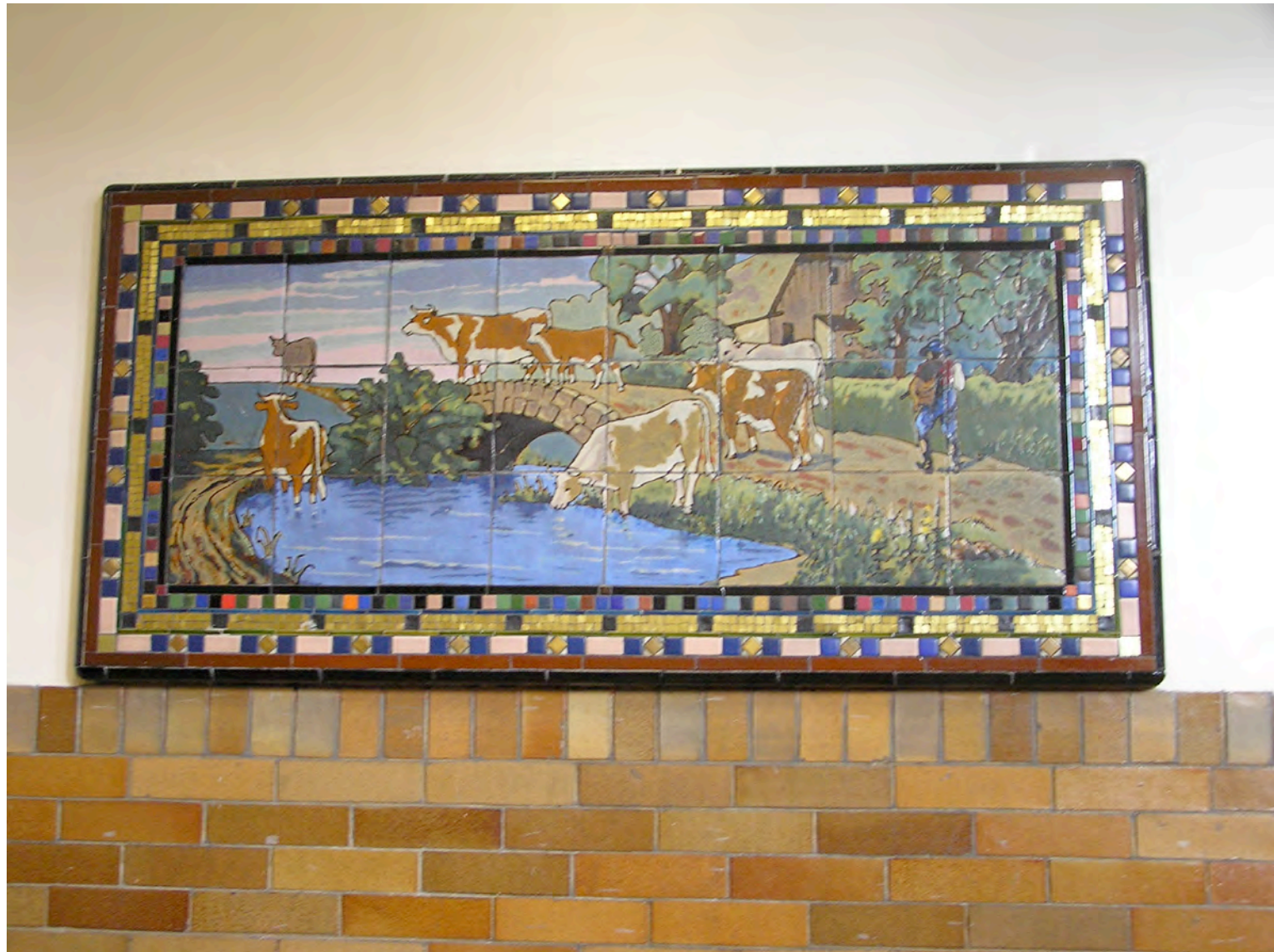
Fig. Oak. 9 - Country Scene with Cows , tile wall panel, approx. 2 x 5 ft.