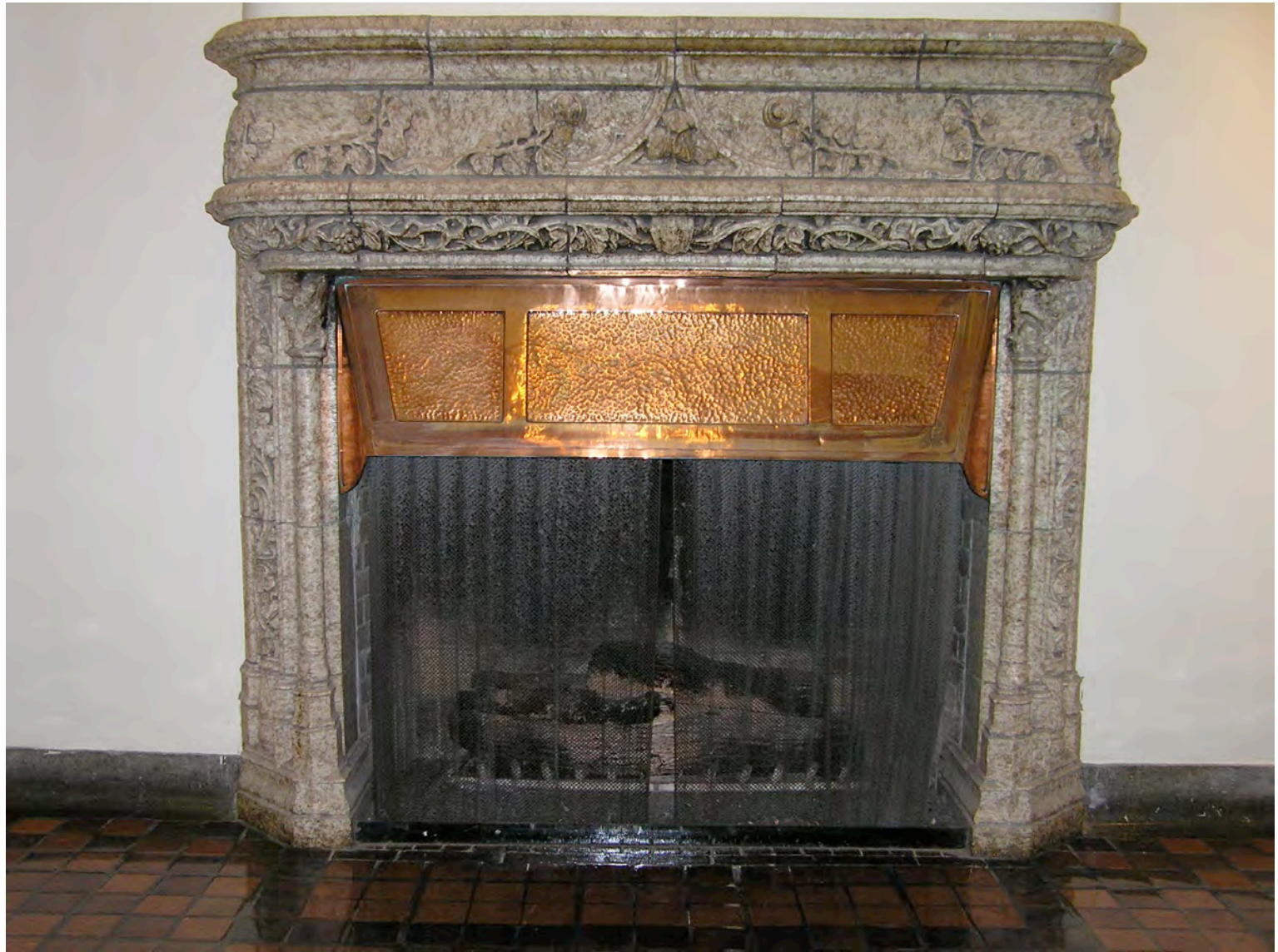
Fig. ETHS 5 - One of two stone fireplaces in the Welcome Hall.