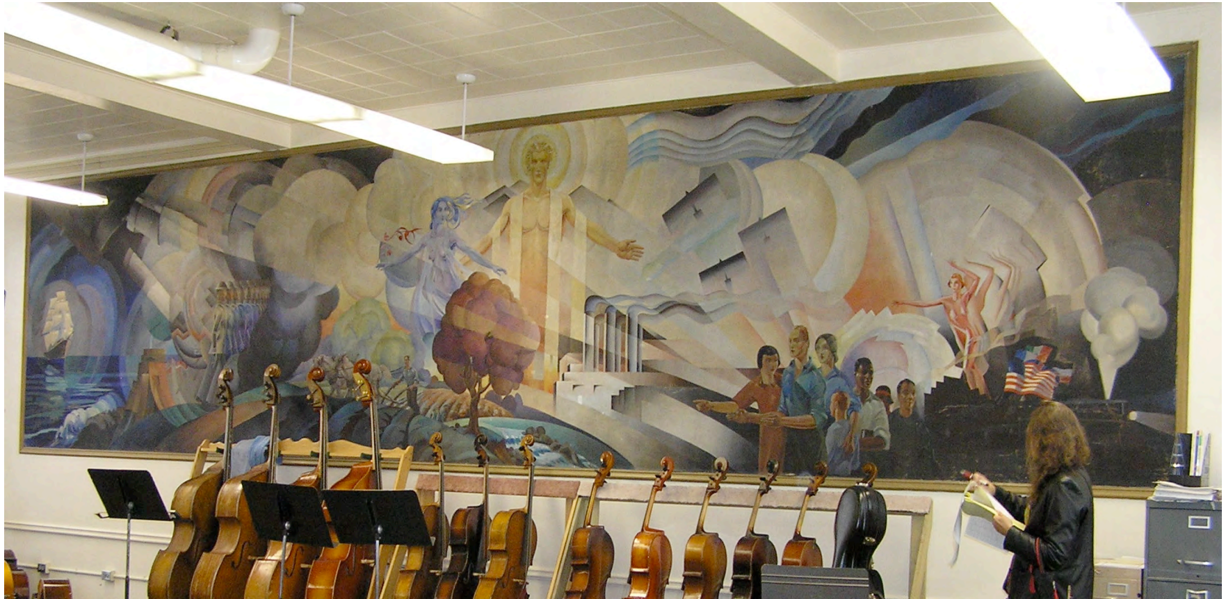
Fig. H. 4 - Carl Scheffler, Mural in Music Room, 1936, oil on canvas, approx. 6.5 x 30 ft.