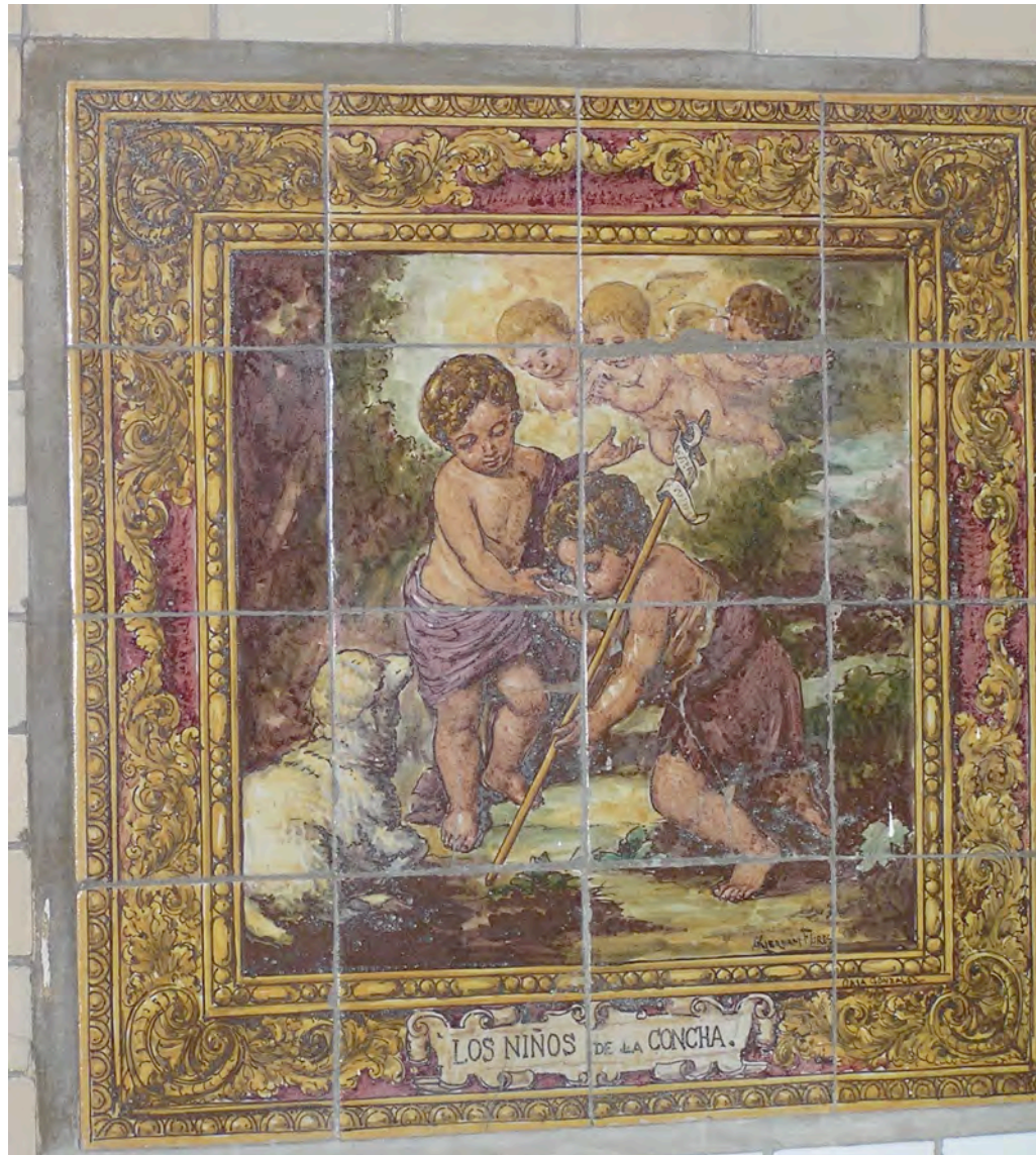
Fig. N. 14 - Wall installation of rare tiles above one of the water fountains.