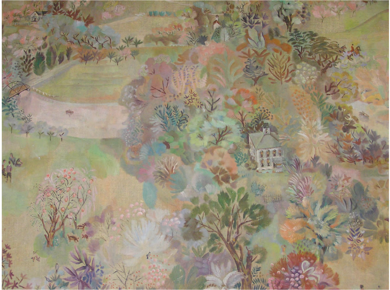
Fig. H. 6 - Rainey Bennett, Mural in Drama Room (detail of landscape), 1930s, oil on canvas, approx. 6.5 x 30 ft.