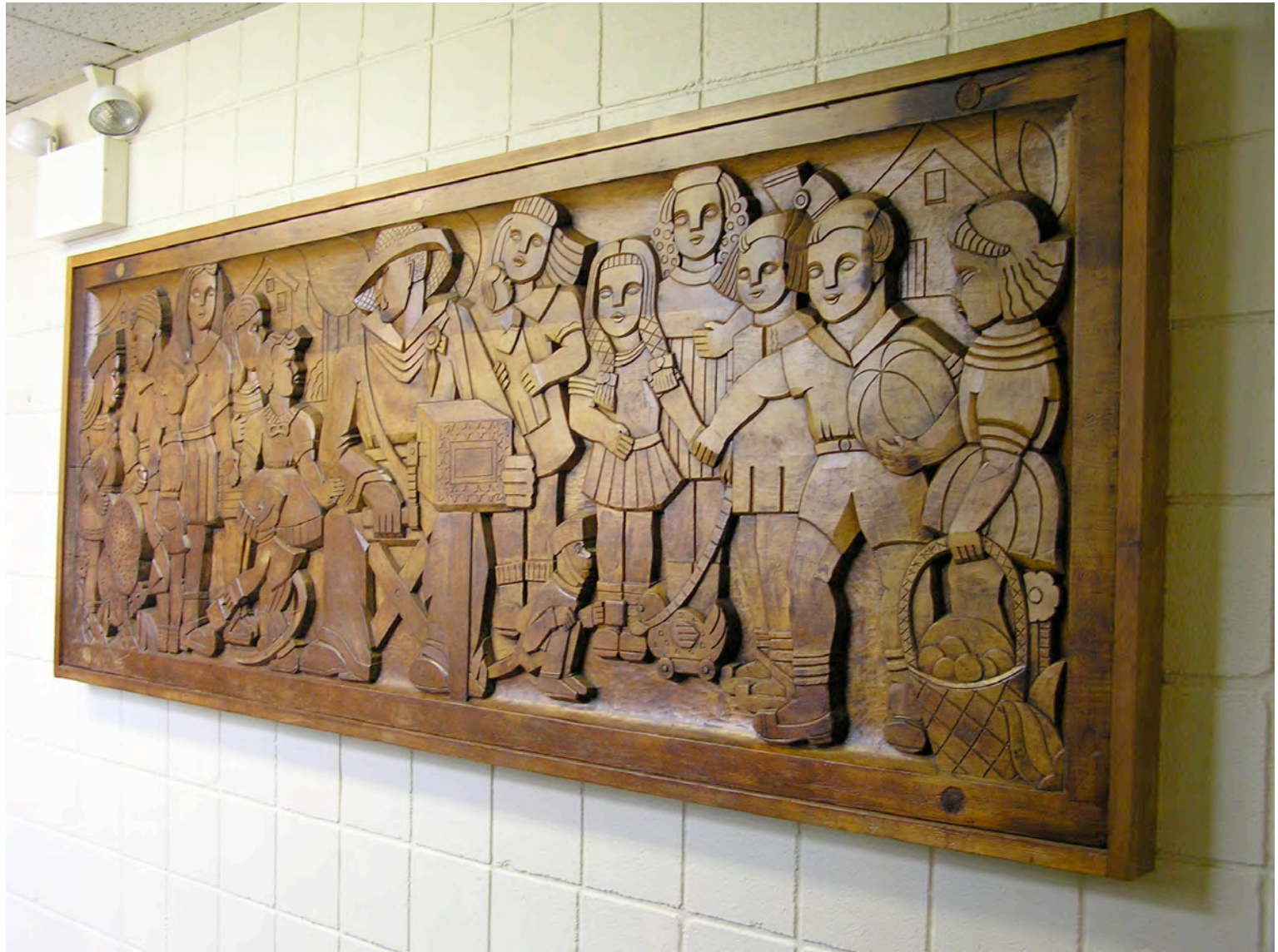
Fig. L. 10 - Louise Pain, Organ Grinder , 1930s (WPA), pine, approx. 3 x 8 ft.