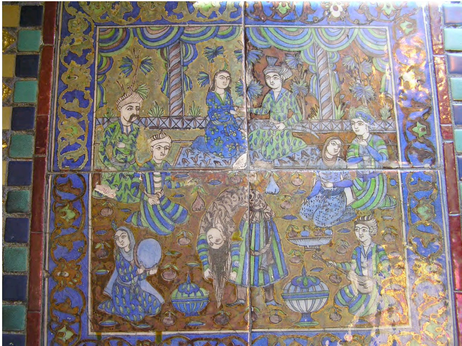
Fig. L. 5 - Tabletop installation of Persian tiles, from table with damaged corner shown in previous image.