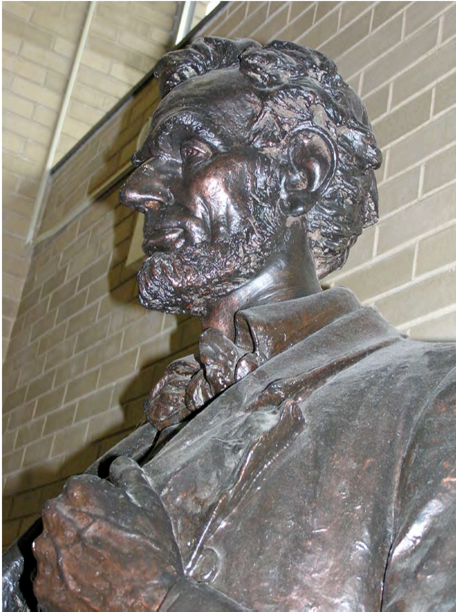
Fig. L. 11 - Statue of Lincoln (detail), painted plaster.