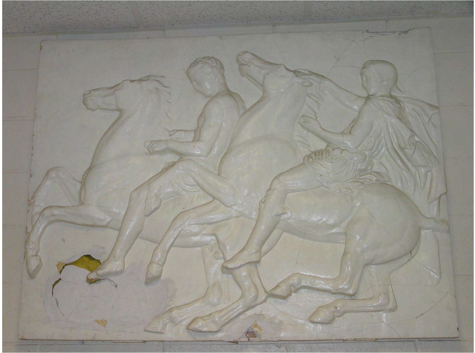
Fig. H. 3 - Horsemen from Parthenon Frieze , plaster cast (damaged; 1 of 6 casts in first-floor hallway).