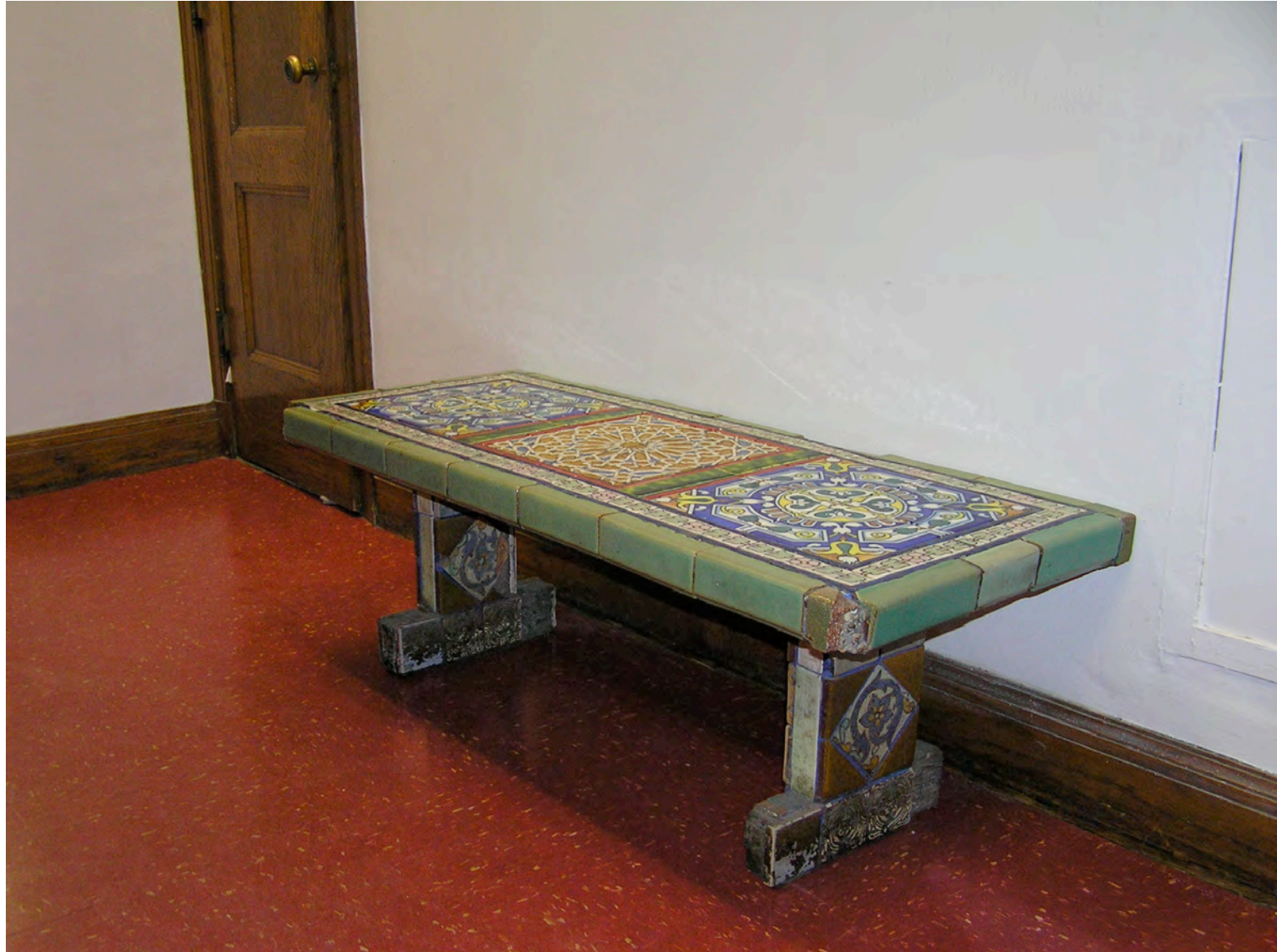
Fig. N. 5 - Tile bench, assembled from rare tiles collected by Frederick Nichols (one of about a dozen such benches donated to Evanston schools).