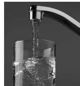
...and brought to your tap!