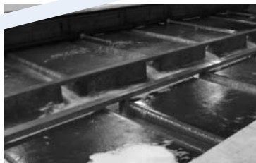
...filtered for purity...