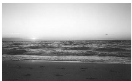
From Lake Michigan...