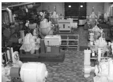
...to our Pumping Facility...