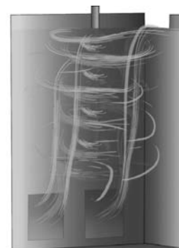
...“Flash” mixed and disinfected...