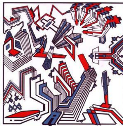
Michigan Avenue , 36"x36". Framed.