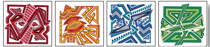
Four Seasons . (Winter, Summer, Spring, Fall) 38"x33". Framed