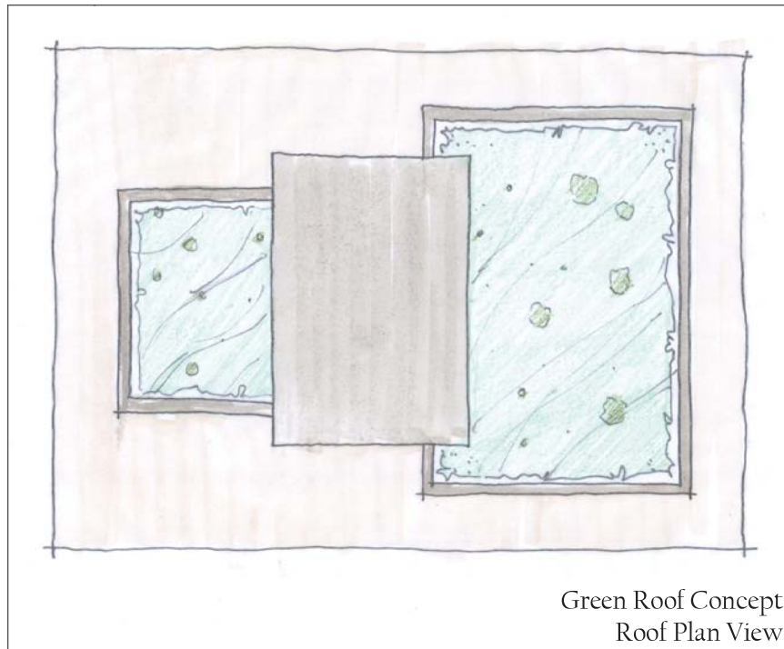
Green Roof Concept Roof Plan View